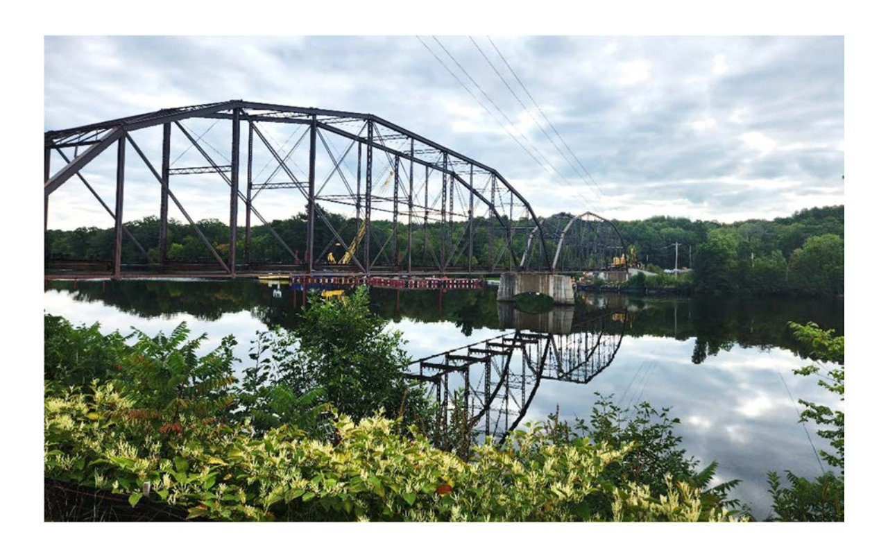
WISCONSIN DEPARTMENT OF TRANSPORTATION