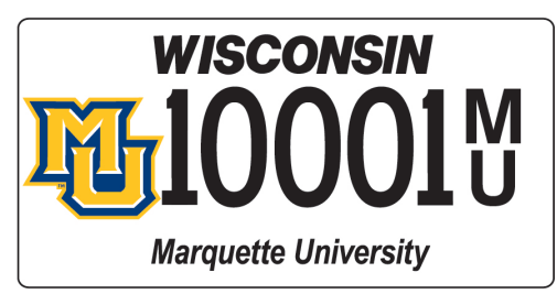
Marquette University plate

MV2591 1/2019 s.341.14(6r)(f)61 Wis. Stats.