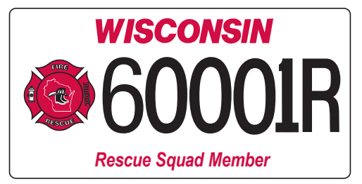
Rescue Squad Member