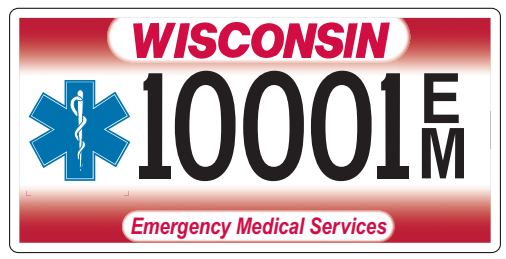
Emergency Medical Services red design