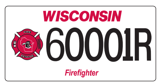
Firefighter white design