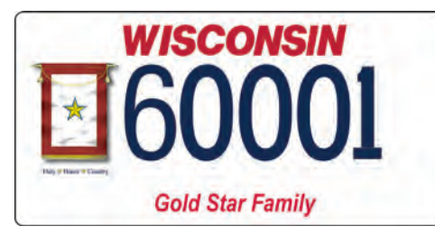
Gold Star plate

MV2951 1/2019 s.341.14(6r)(f)19m Wis. Stats.