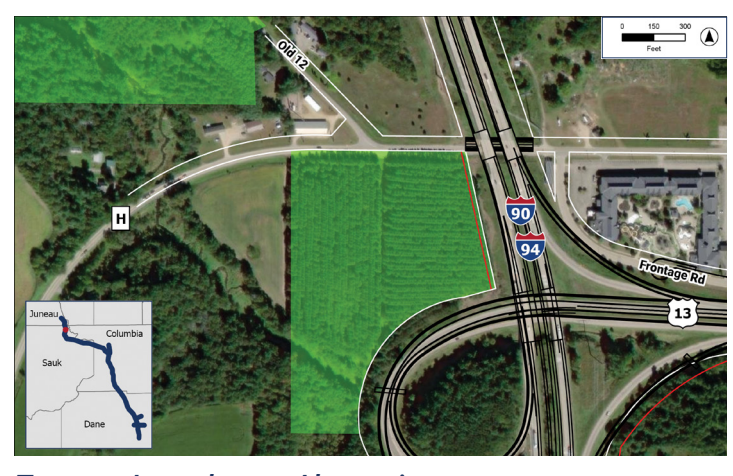
Trumpet Interchange Alternative