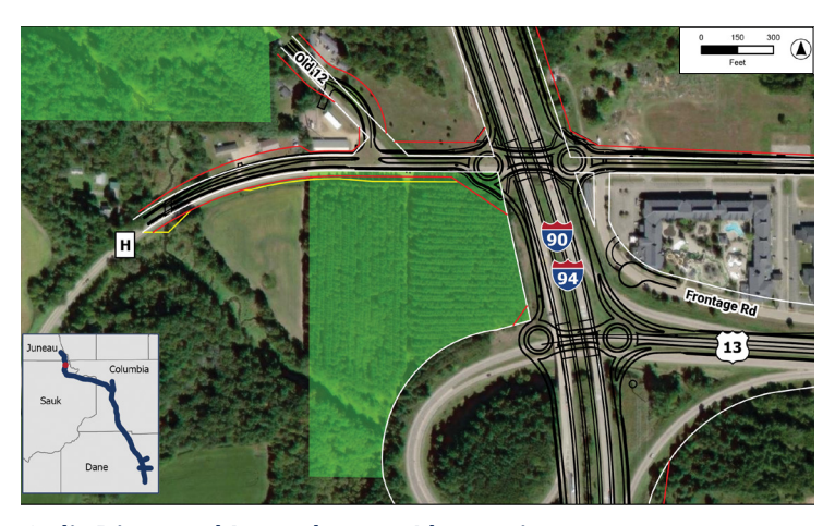
Split Diamond Interchange Alternative