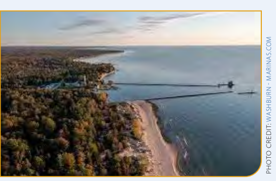
Port of Washburn