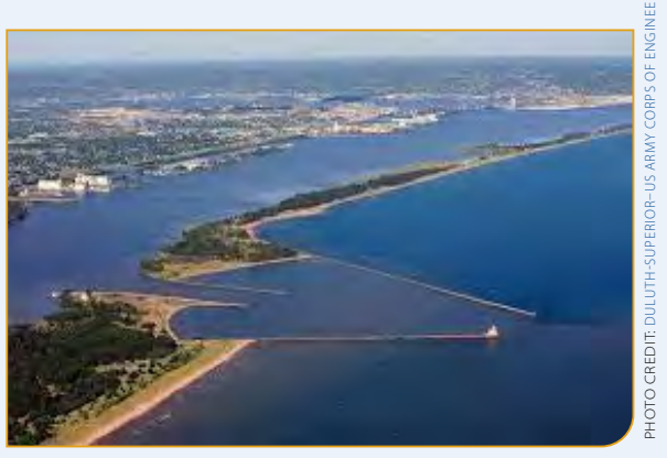
Port of Duluth-Superior

Two 82-metric ton rail-mounted gantry cranes lifting 125 metric tons in tandem (greater capability cranes available on demand). A fleet of forklift trucks with capacities of up to 55,000 pounds. Roll on/roll off ramp with immediate access to Interstate highway and designated heavy-lift route.