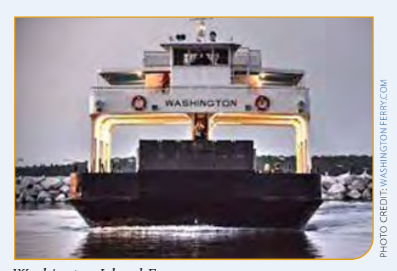
Washington Island Ferry

The Washington Island Ferry is located at the tip of the Door Peninsula, in the Northeast corner of Wisconsin. The Washington Island Ferry is accessed via WIS 42 at the Northport Pier. Their fleet uses Coast Guard-approved modern steel ferries that make up to 25 round trips a day during the high season and two round trips per day in the winter. Washington Island is a popular tourist destination.