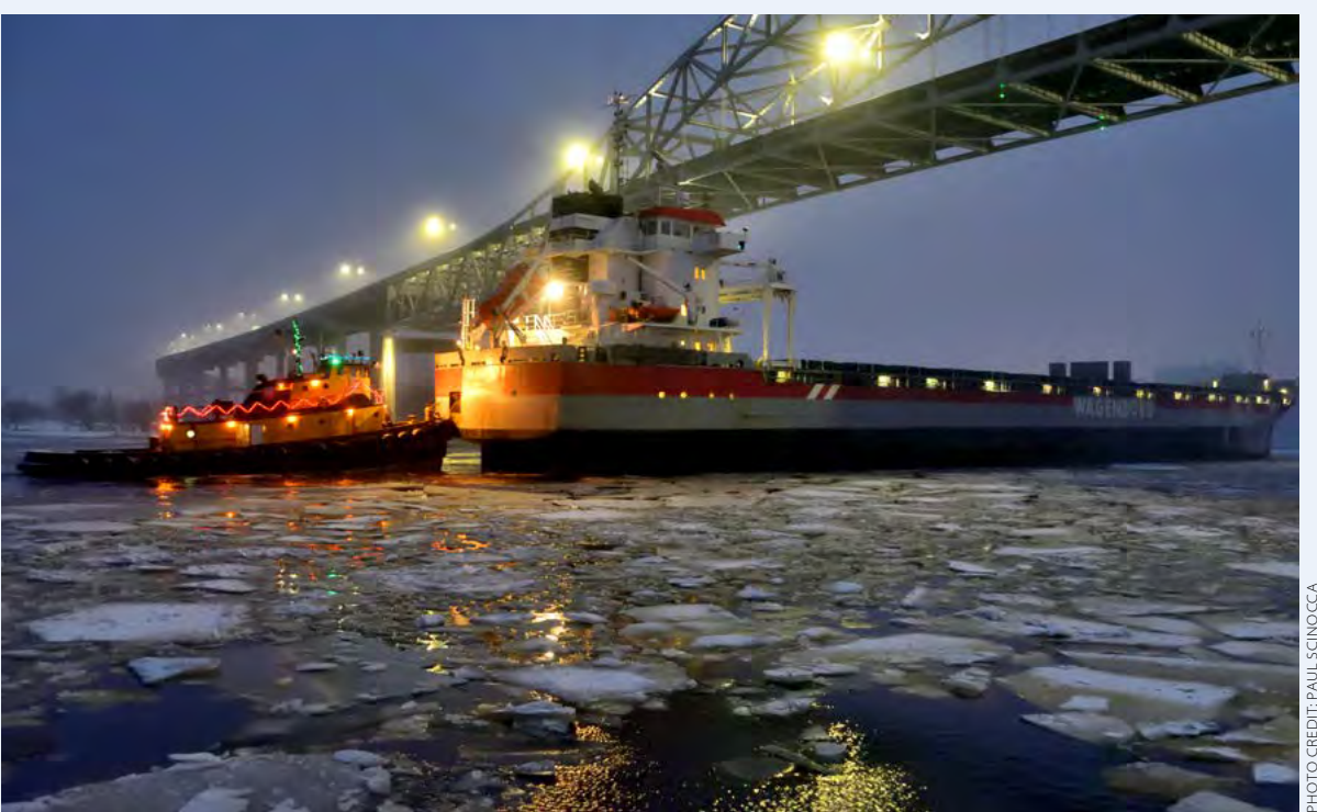
A ship passes under the Blatnik Bridge near Superior, Wis.

Ice breakers and other lake carriers directly impact Wisconsin's economy through off-season layup ship repairs in ports such as Superior, Marinette, and Milwaukee. The Lake Carriers' Association estimated that from 2021 to 2023, annual layup investment has averaged over $40 million in Wisconsin.