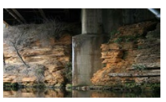
Bridge abutment on sandstone on WIS 13 in Wisconsin Dells.

Sandstone samples subjected to the modified slake test exhibited significant mass loss. Sandstone's GSN and \beta were higher than those of limestone/dolostone, gneiss and granite, indicating that, under high stream powers, sandstone is more susceptible to higher scour rates than the other rock types investigated.