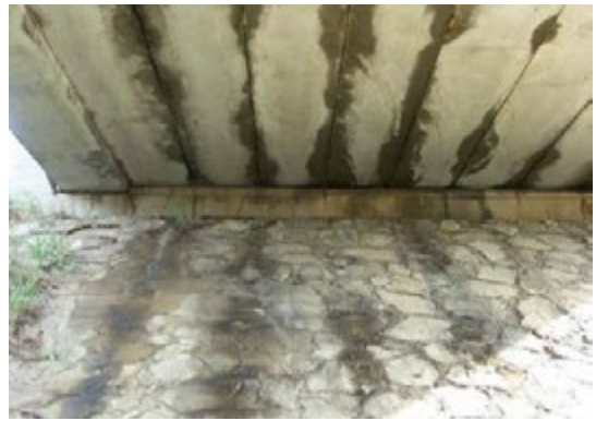
Moisture ingress through cracks and shear keys.

Deck cracking over the shear keys was documented shortly after construction and after five months. Refined finite element analysis was conducted by incorporating user subroutines to simulate concrete strength and shrinkage development with time. The temperature gradient effect was also investigated.