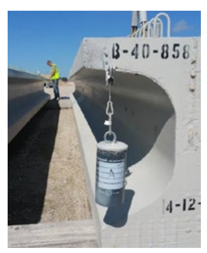
Camber was measured early in the morning to mitigate thermal effects.

Five mixtures were selected for further testing under the mixing, curing and quality control procedures of the three precastors, and the specimens' creep and shrinkage were examined for 280 days. One mixture was selected for casting a full-scale prestressed SCC girder to monitor structural performance, and a conventional concrete (CC) girder with similar target compressive strength was fabricated as a control specimen. Prestress losses and camber for both the SCC and CC girders were then monitored in the precast yard for 161 days, and their transfer lengths were measured for 28 days.