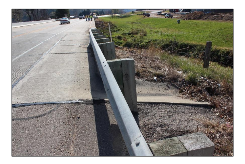
Figure 2.7.1-1: Assessment 9001 – Approach Drainage. Note concrete flume.

It is the inspector's task to examine each approach drainage assessment and reasonably assign the most severe assessment state to the "each" quantity. This will quantify the assessment's state of deterioration and help generate quantity/cost estimates for future remedial work.