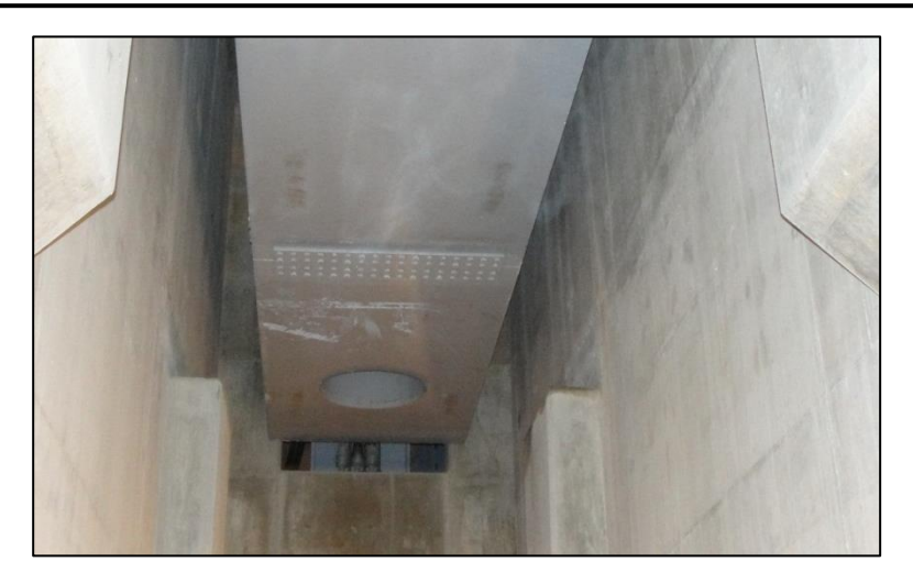
Figure 2.7.1-6: Assessment 9020 – Movable Bridge Counterweight.

Good: Counterweight is in good condition, no problems noted.