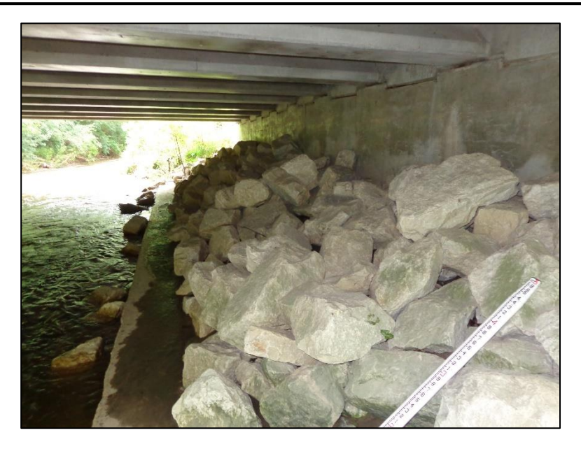
Figure 2.7.1-13: Assessment 9045 – Slope Protection – Riprap.

Good: Riprap is adequate, sound and protecting the embankments adjacent to the