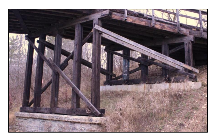
Figure 2.7.1-18: Assessment 9250 – Crash Walls/Web Walls/Cross Bracing or Struts.

It is the inspector's task to examine each system and reasonably assign the most severe assessment condition to each assessment. This will quantify the assessment's state of deterioration and help generate quantity/cost estimates for future remedial work.