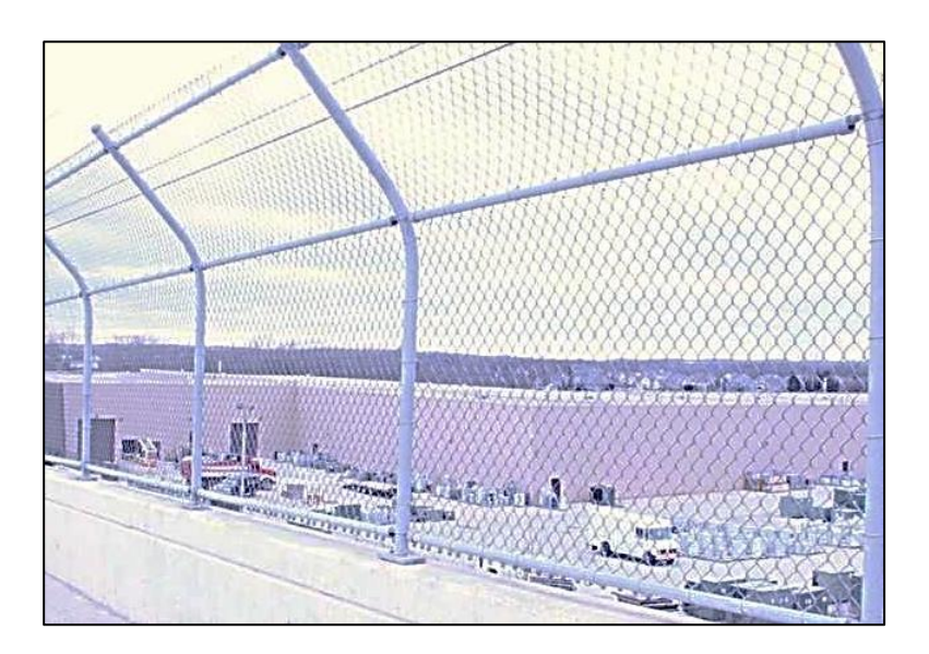
Figure 2.7.1-26: Assessment 9337 – Protective Screening

It is the inspector's task to examine each protective screening assessment and reasonably assign the most severe assessment condition to each assessment. This will quantify the assessment's state of deterioration and help generate quantity/cost estimates for future remedial work.