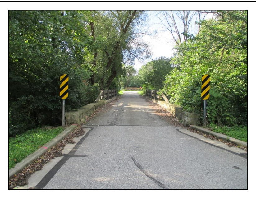
Figure 2.7.1-8: Assessment 9030 – Signs – Object Markers.

Good: Sign is present and is in good condition (there may be superficial damage or