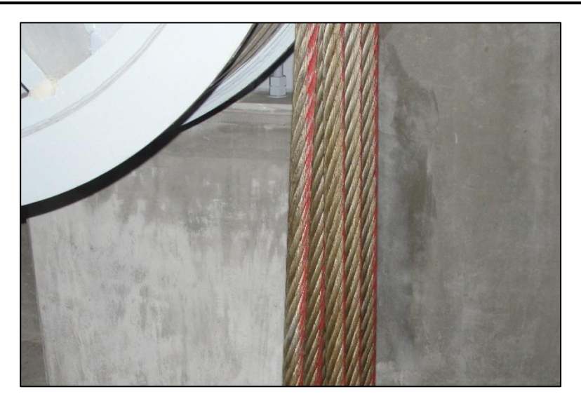
Figure 2.7.1-7: Assessment 9021 – Movable Bridge Cables.

Good: Cables are in good condition and are properly functioning