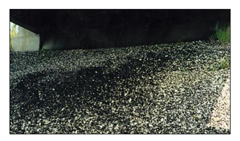
Figure 2.7.1-12: Assessment 9043 – Slope Protection – Crushed Aggregate Sprayed with Bituminous.

It is the inspector's task to examine each slope protection system and reasonably assign the most severe assessment condition to each assessment. This will quantify the assessment's state of deterioration and help generate quantity/cost estimates for future remedial work.