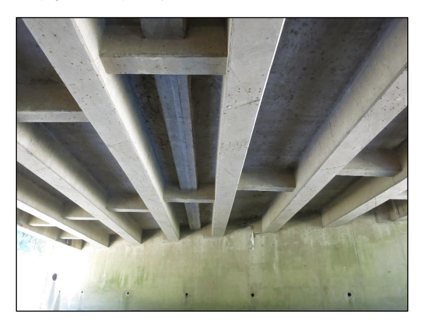
Figure 2.7.1-15: Assessment 9168 – Concrete Diaphragm.

It is the inspector's task to examine each diaphragm and reasonably assign the most severe assessment condition to each assessment. This will quantify the assessment's state of deterioration and help generate quantity/cost estimates for future remedial work.