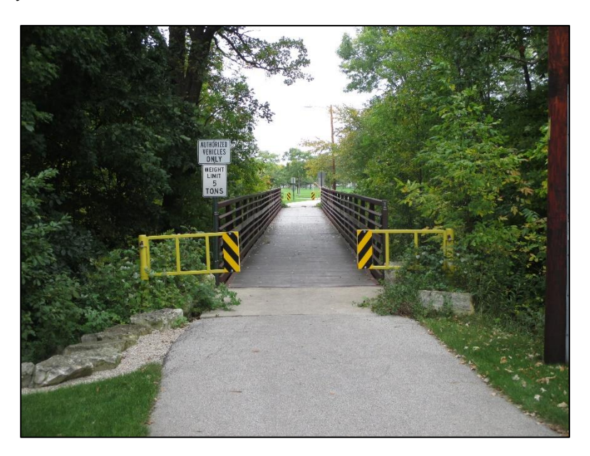
Figure 2.7.1-10: Assessment 9034 – Signs – Weight Limit Posting.

It is the inspector's task to examine each sign and reasonably assign the most severe assessment condition. This will quantify the assessment's state of deterioration and help generate quantity/cost estimates for future remedial work.