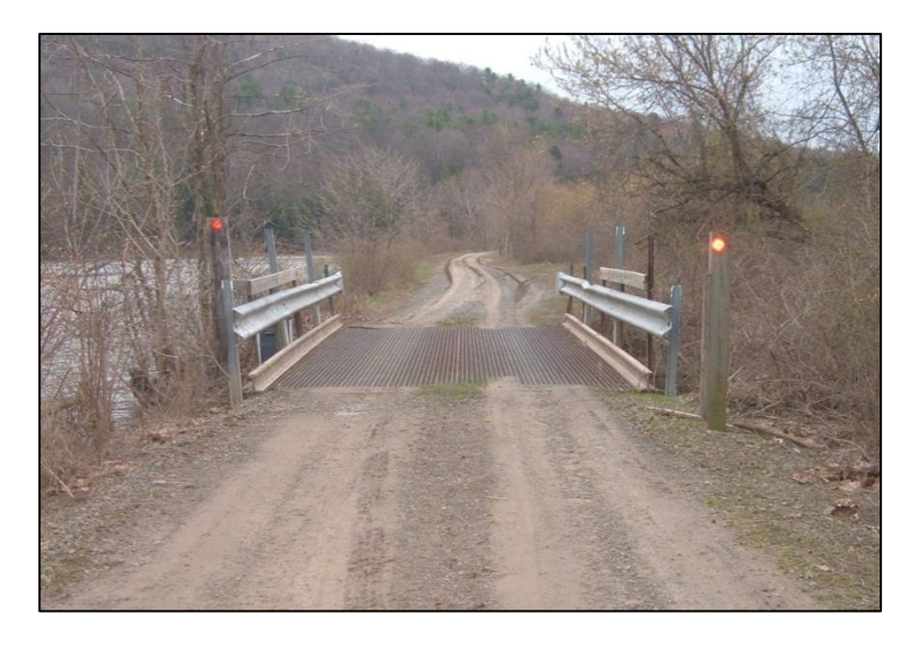
Figure 2.7.1-22: Assessment 9324 – Gravel Approach Roadway.

It is the inspector's task to examine each system and reasonably assign the most severe assessment condition to each assessment. This will quantify the assessment's state of deterioration and help generate quantity/cost estimates for future remedial work.