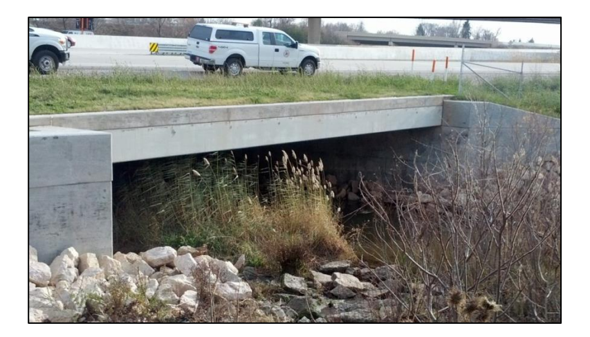
Figure 2.7.1-23: Assessment 9325 – Roadway over Structure.

It is the inspector's task to examine each roadway and reasonably assign the most severe assessment condition to each assessment. Quantifying these amounts helps to generate quantity/cost estimates for future remedial work.