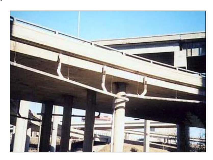
Figure 2.7.1-2: Assessment 9004 – Deck Drainage.

It is the inspector's task to examine all deck drainage and reasonably assign the most severe assessment condition to each drain found within the limits of the bridge deck. This will quantify the assessment's state of deterioration and help generate quantity/cost estimates for future remedial work.