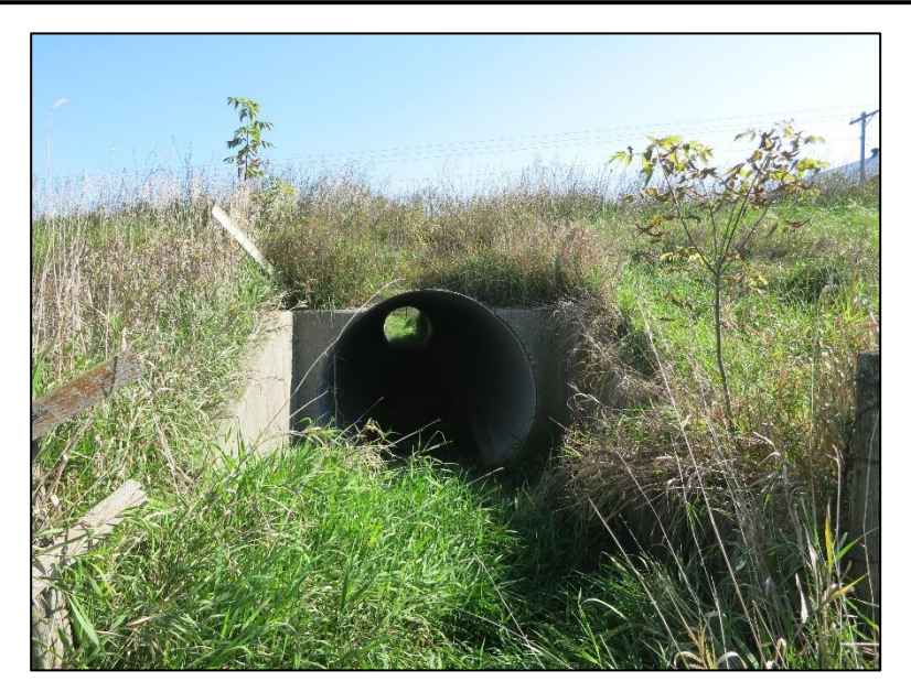
Figure 2.7.1-17: Assessment 9248 – Culvert End Treatment.