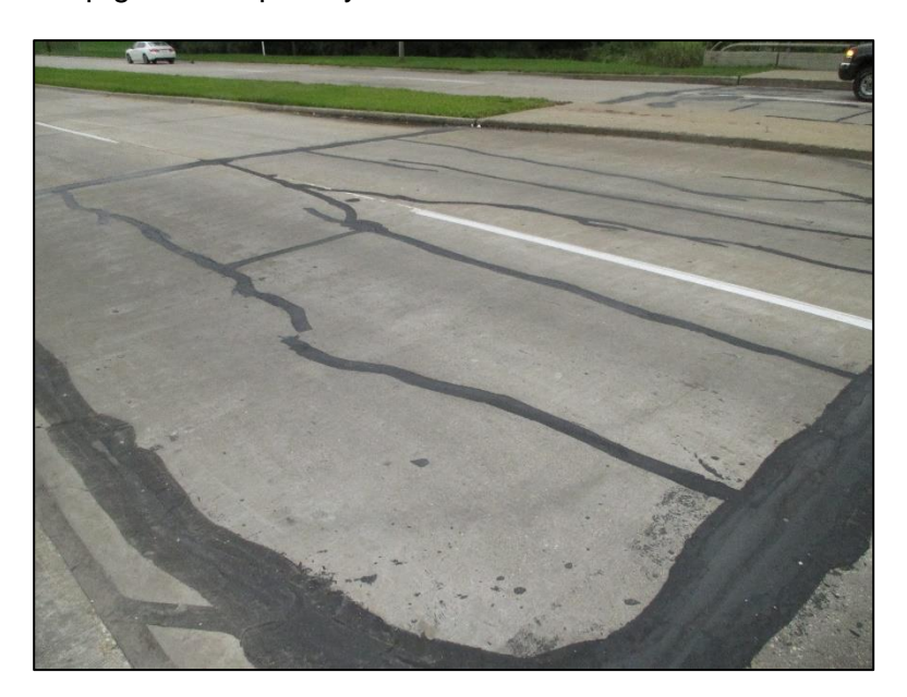
Figure 2.7.1-20: Assessment 9322 – Concrete Approach Roadway.

It is the inspector's task to examine each system and reasonably assign the most severe assessment condition to each assessment. This will quantify the assessment's state of deterioration and help generate quantity/cost estimates for future remedial work.