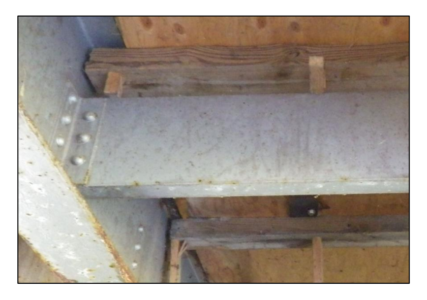
Figure 2.7.1-14: Assessment 9167 – Steel Diaphragm.

It is the inspector's task to examine each diaphragm and reasonably assign the most severe assessment condition to each assessment. This will quantify the assessment's state of deterioration and help generate quantity/cost estimates for future remedial work.