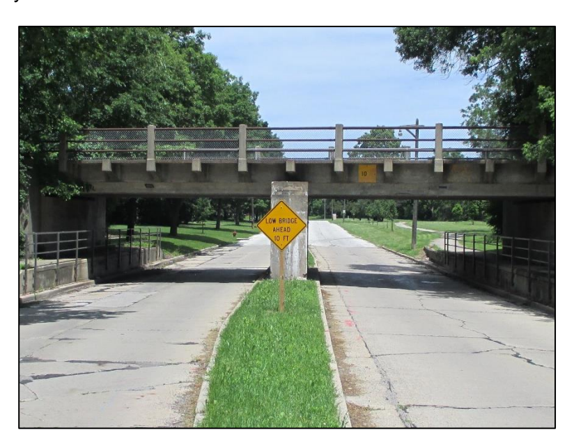
Figure 2.7.1-9: Assessment 9033 – Signs – Vertical Clearance.

It is the inspector's task to examine each sign and reasonably assign the most severe assessment condition. This will quantify the assessment's state of deterioration and help generate quantity/cost estimates for future remedial work.