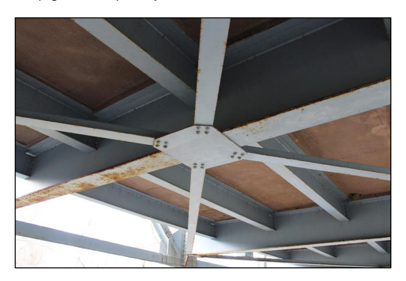
Figure 2.7.1-16: Assessment 9169 – Lateral Bracing.

On the inspection report form, lateral bracing systems are recorded in units of "each" per span of the bridge regardless of the number of trusses, bays, or girder lines. It is the inspector's task to examine the lateral bracing system in each span and reasonably assign the most severe assessment condition to each assessment. This will quantify the assessment's state of deterioration and help generate quantity/cost estimates for future remedial work.