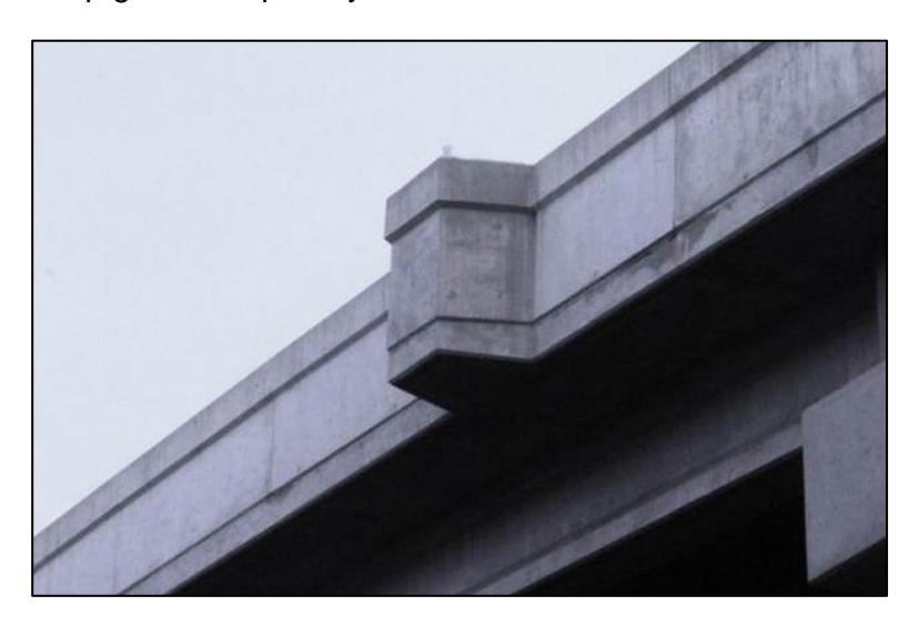
Figure 2.7.1-25: Assessment 9336 – Luminaire Bases.

It is the inspector's task to examine each luminaire base and reasonably assign the most severe assessment condition to each assessment. This will quantify the assessment's state of deterioration and help generate quantity/cost estimates for future remedial work.