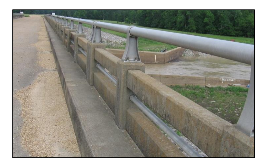
Figure 2.7.1-24: Assessment 9335 – Decorative Rail.

It is the inspector's task to examine each decorative rail assessment and reasonably assign the most severe assessment condition to each assessment. This will quantify the assessment's state of deterioration and help generate quantity/cost estimates for future remedial work.