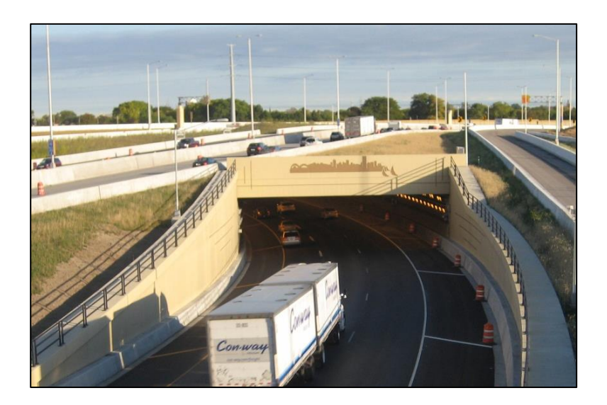
Figure 2.7.1-4: Assessment 9010 – Aesthetic Treatment.

assessment's state of deterioration and help generate quantity/cost estimates for future remedial work.