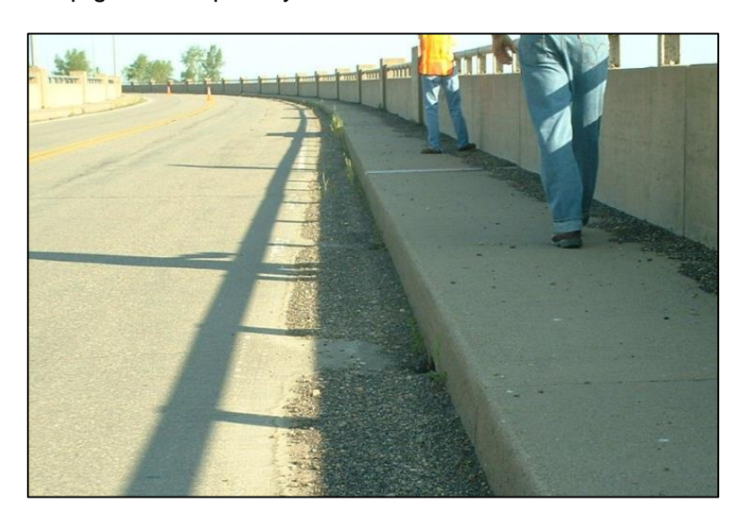
Figure 2.7.1-3: Assessment 9009 – Sidewalk.

It is the inspector's task to examine each sidewalk and reasonably assign the most severe assessment condition to the each assessment. This will quantify the assessments state of deterioration and help generate quantity/cost estimates for future remedial work.