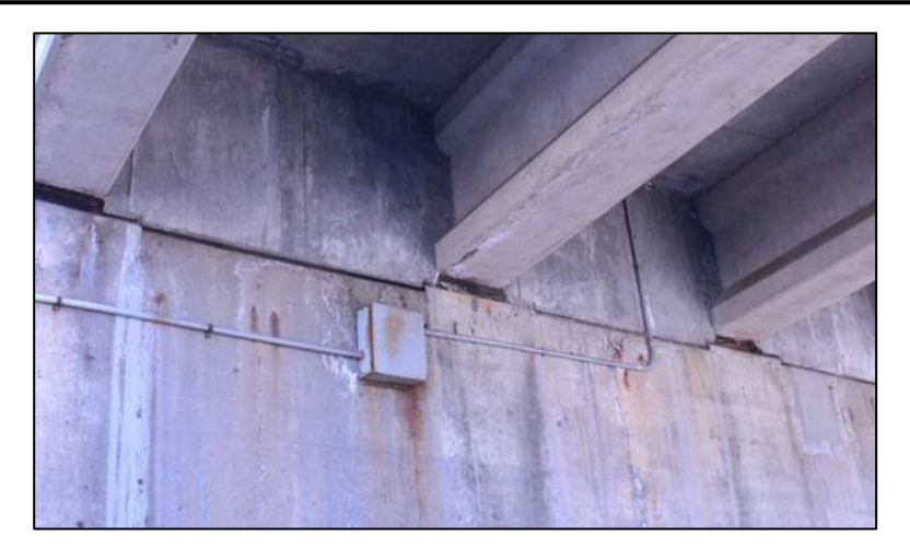
Figure 2.7.1-5: Assessment 9011 – Utilities.

Good: Utility is in excellent condition, no problems noted.