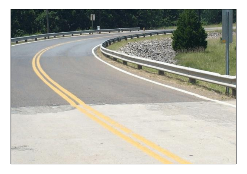
Figure 2.7.1-21: Assessment 9323 – Asphalt Approach Roadway.

It is the inspector's task to examine each system and reasonably assign the most severe assessment condition to each assessment. Quantifying these amounts helps to generate quantity/cost estimates for future remedial work.