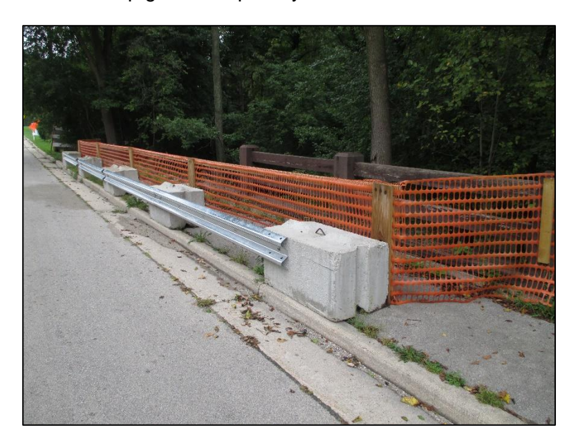
Figure 2.7.1-11: Assessment 9036 – Bridge Closure System. Note assessment used for sidewalk closure.

It is the inspector's task to examine each bridge closure system and reasonably assign the most severe assessment condition to each assessment. This will quantify the assessment's state of deterioration and help generate quantity/cost estimates for future remedial work.