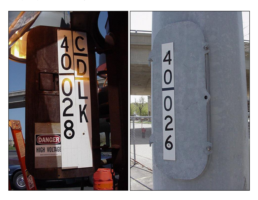
Figure 4.3.5-5: View of the Hatch Doors for Old and New High Mast Light Towers.

Refer to Figure 4.3.5-5 for a close-up view of the hatch doors on an old and a new high mast light tower. There are differences in the door design on the older structures as shown on the left compared to the new structures as shown on the right. The new door is secured with bolts, a lock in easily accessible areas such as Park and Rides, and no longer has a latch. Note that the electrical circuit plaque has not yet been installed on the new structure.