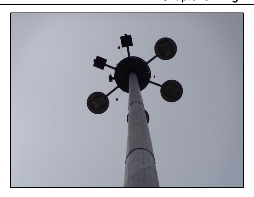
Figure 4.3.4-2: View of Luminaire Ring.

Refer to the following assessment states: