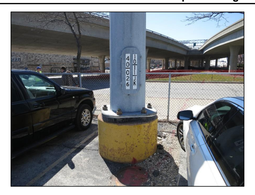
Figure 4.3.4-6: View of a Structure ID Plaque.