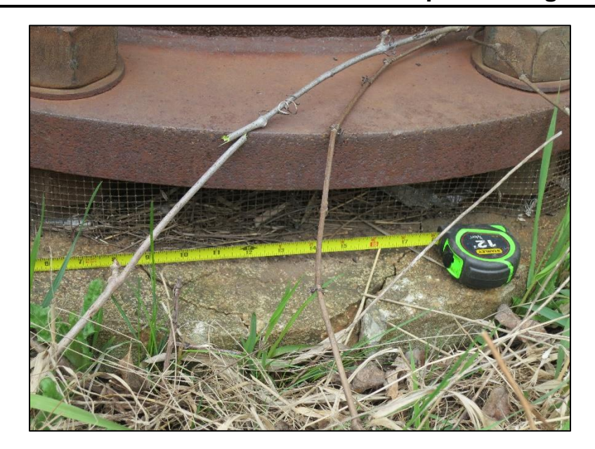
Figure 4.3.4-1: View of Rodent Screen between Base Plate and Foundation.

Refer to the following assessment states: