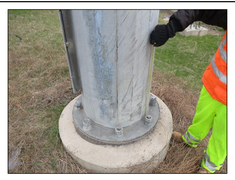
Figure 4.3.3-7: View of Minor Scraping Exhibited at the Bottom of the Vertical Pole. (Condition State 2).