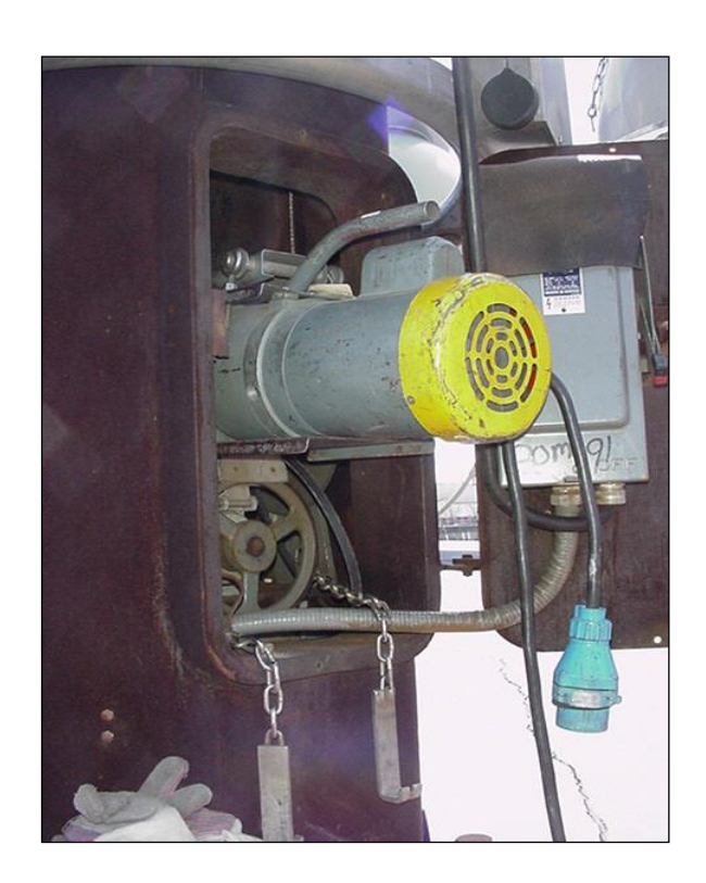
Figure 4.3.5-3: View of the Hatch Opening and Internal Winch System with a Portable Motor.