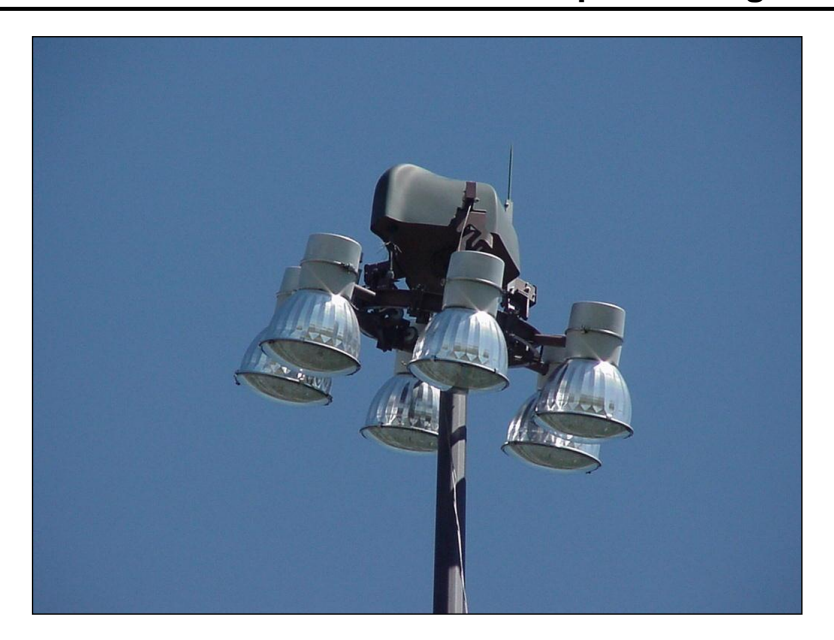
Figure 4.3.5-4: View of a Misaligned Luminaire Ring.

Refer to Figure 4.3.5-5 for a close-up view of the hatch doors on an old and a new high mast light tower. There are differences in the door design on the older structures as shown on the left compared to the new structures as shown on the right. The new door is secured with bolts, a lock in easily accessible areas such as Park and Rides, and no longer has a latch. Note that the electrical circuit plaque has not yet been installed on the new structure.