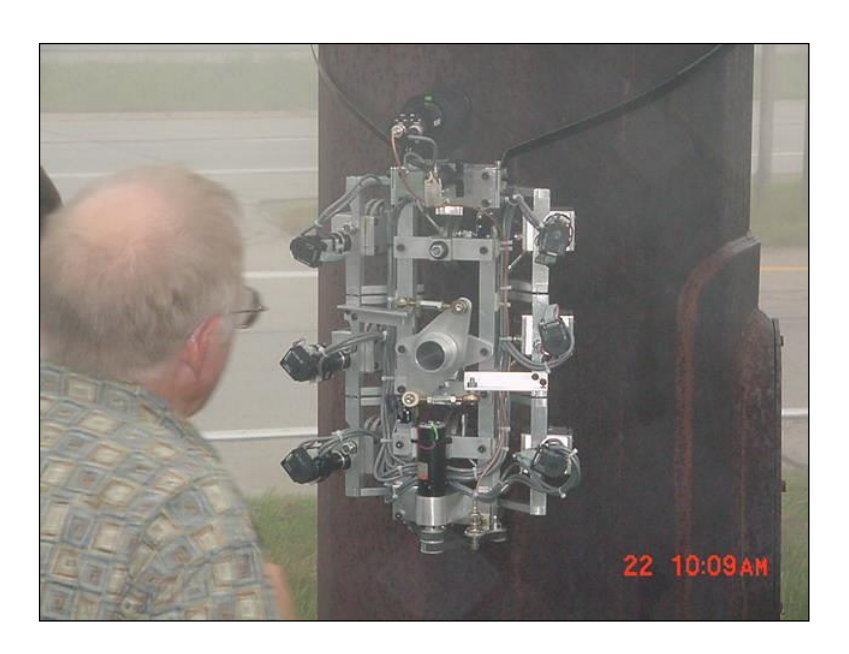
Figure 4.3.5-1: View of a Magnetic Climbing Camera Unit Used During Close Visual Inspection.

If severe deterioration is noted or suspected during the maintenance related or routine inspections, a need for an in-depth inspection may be warranted. A detailed inspection will be scheduled on an as-needed basis.