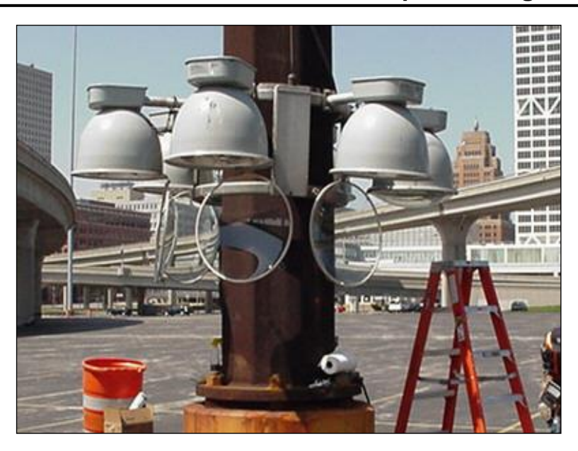
Figure 4.3.5-2: View of a Typical Luminaire Ring, Lowered for Maintenance.