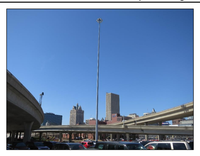
Figure 4.3.3-1: Overall View of a Typical High Mast Light Tower.