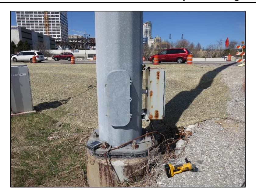
Figure 4.3.4-4: View of a Handhole Cover.