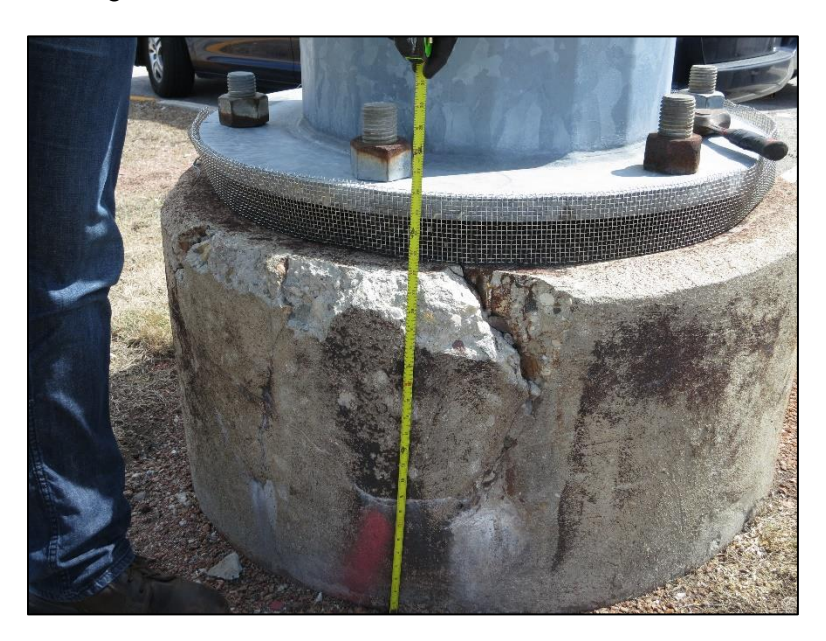
Figure 4.3.3-3: View of a Delaminated/Spalled Concrete Foundation – Condition State 3.

Reinforced concrete bases and foundations are made by placing ready-mix concrete into slip forms steel reinforcing throughout the foundation. The soil adhesion, skin friction, and bearing pressure resist loading from the structure.