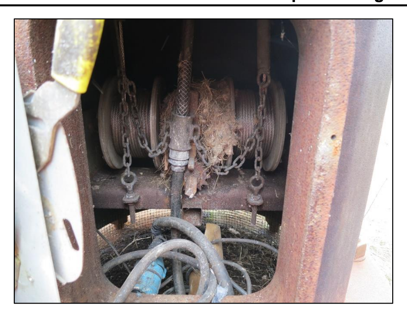
Figure 4.3.4-3: View of an Internal Winch System. Note Nesting Material Located Between Spools.

Refer to the following assessment states: