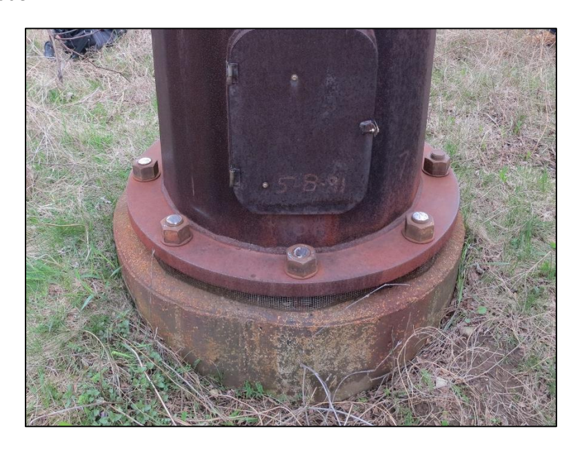
Figure 4.3.3-6: View of Weathering Steel Base Plate.

This assessment element defines the base plates, flanges, gusset plates, seam welds, and welds at the connection of the column support to the foundation. Base plates are typically welded to the pole, and secured to the anchor rods using high strength nuts and washers. Leveling nuts are used below the base plate to align the structure, and the anchor nuts are utilized to secure the plate to the leveling nuts. The base plate transfers loads from the pole to the anchor rods.