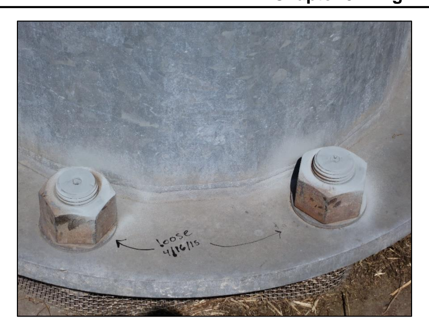
Figure 4.3.3-5: View of Loosened Anchor Rods. Note No Jam Nuts Over Anchor Nuts. Condition State 4 (2 Each).