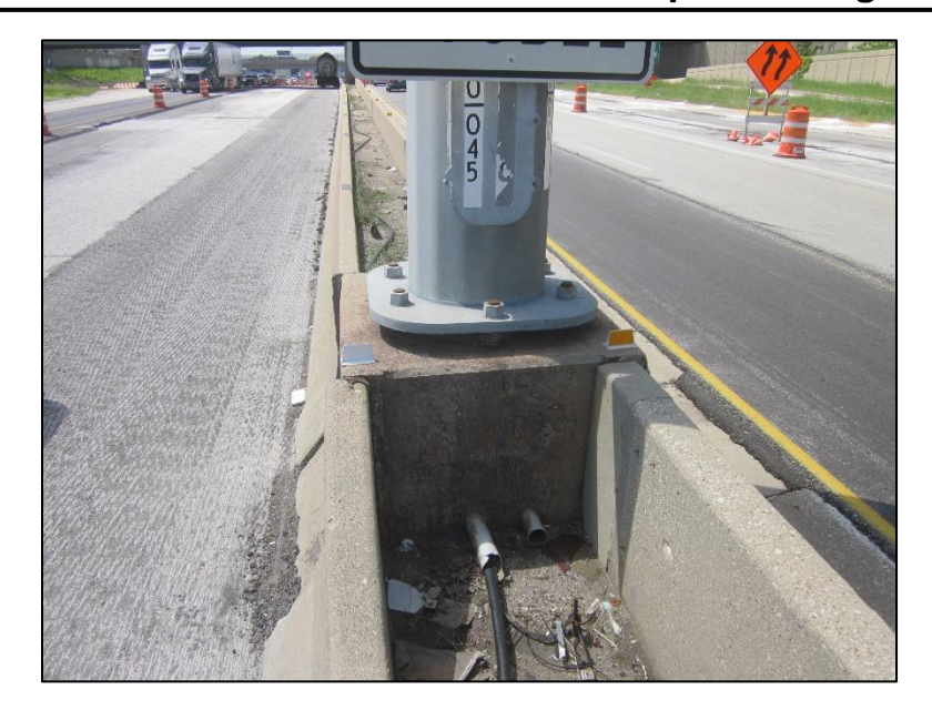
Figure 4.3.4-5: View of Barrier Wall Acting as Crash Protection System for Structure.

Refer to the following assessment states: