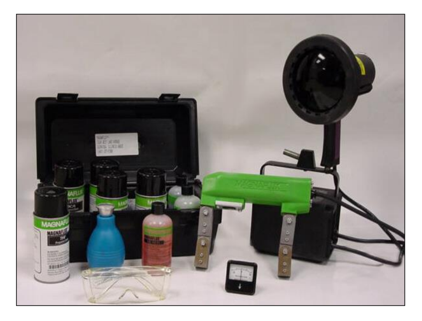
Figure 5.7.1-2: Magnetic Particle Inspection Kit.

This testing method is covered in American Society for Testing and Materials (ASTM) Test E709, "Standard Guide for Magnetic Particle Examination."