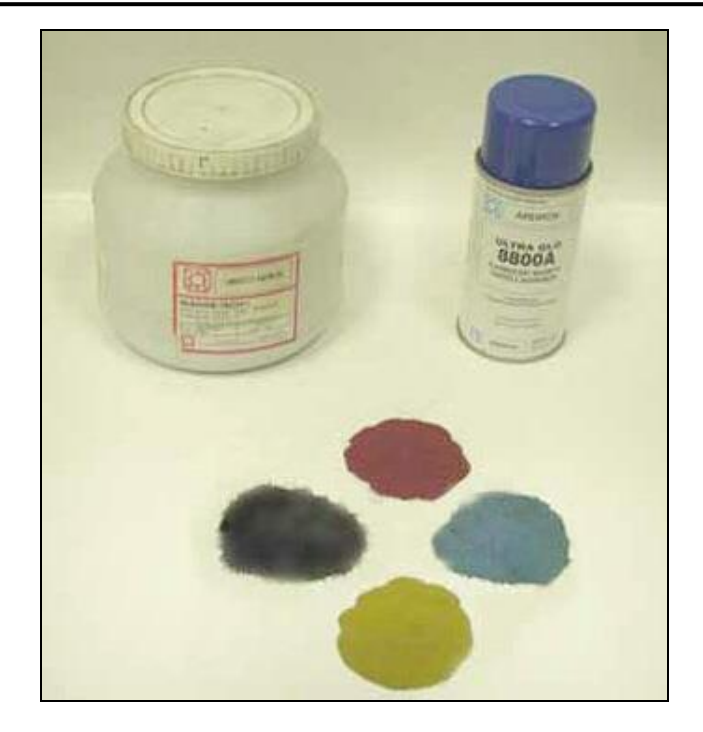
Figure 5.7.1-1: Sample Powder Colors.