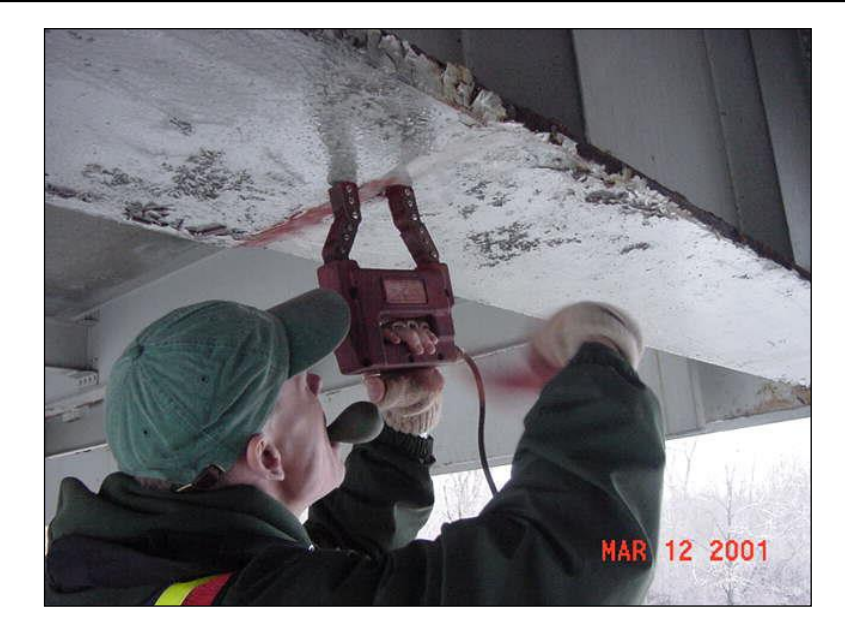
Figure 5.7.2-1: MT on a Built-Up Plate Bridge Girder Butt-Weld.