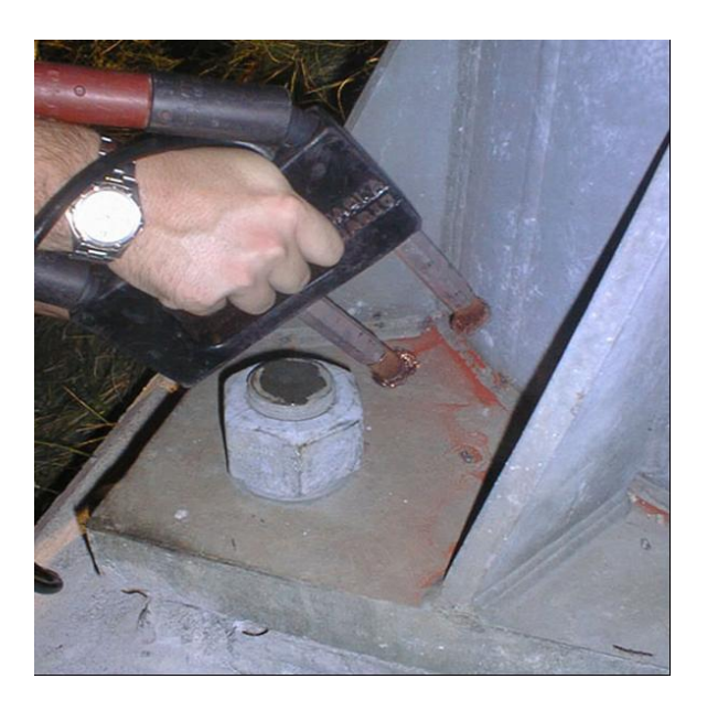
Figure 5.7.2-2: MT on a Sign Structure Base.