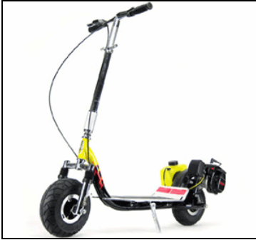
Figure 3: Gas Powered Scooter