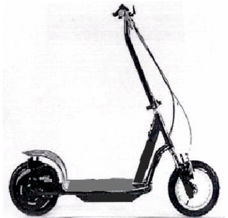
5042 – Scooters/skateboards, powered