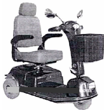
1744 – Motorized vehicles, not elsewhere classified (three or more wheels)