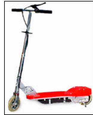
Figure 2 shows another configuration of an electric scooter where the battery and motor are underneath the board on which the user stands. Figure 3 is an example of a gas powered scooter. Gas powered scooters usually use a 2-stroke engine. Notice the motor and gas tank are located above the rear tire and the tires are bigger than those on the electric powered scooters in Figures 1 and 2. Powered scooter-related incidents should be coded under 5042- Scooters/Skateboards, powered. Unpowered scooter-related incidents should be coded under 1329- Scooter, unpowered.