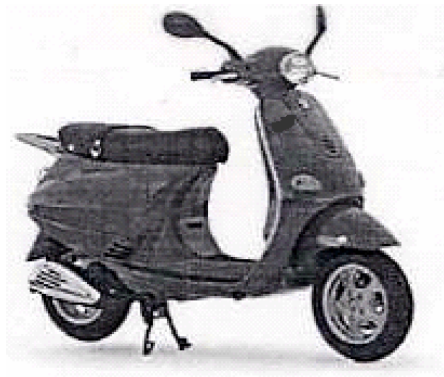
1910 – Licensed two-wheeled motor vehicles (excl. mopeds and trail bikes)