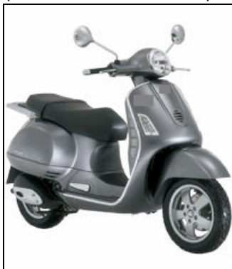
Figure 5: Registered Motor Scooter (NHTSA Jurisdiction)