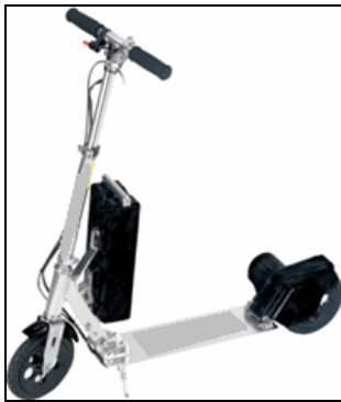
Figure 1: Electric Powered Scooter