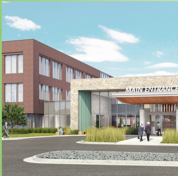
Advocate Aurora Mt. Pleasant