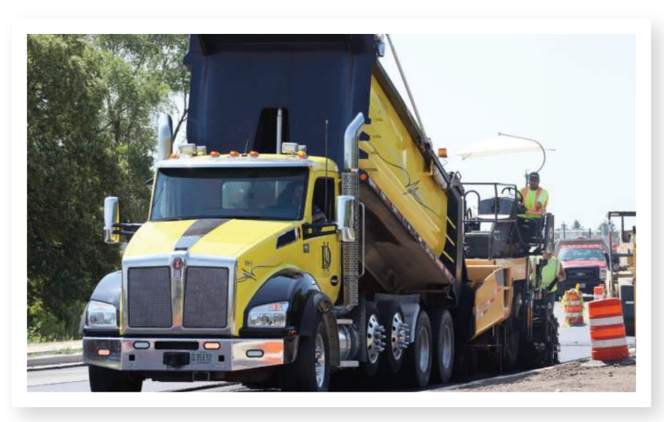
Milwaukee County / I-43 & County Line Road DMS Transportation, LLC

DBE partnership on WisDOT projects makes Wisconsin stronger