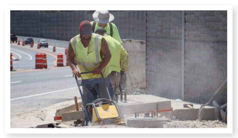
Milwaukee County / I-43 & County Line Road Arrow-Crete Construction, LLC