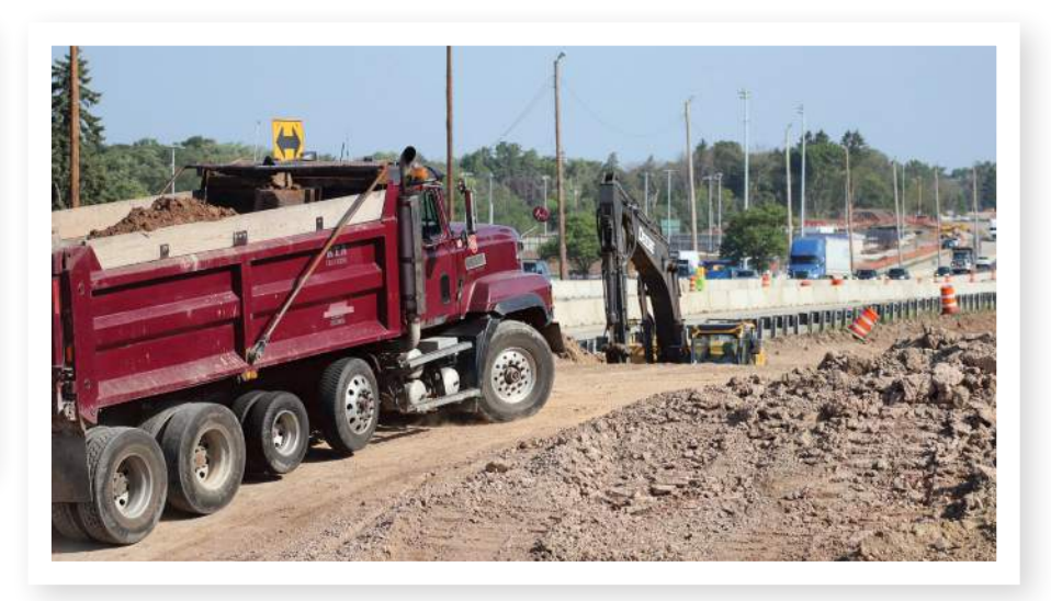
Milwaukee County / 1-43 North South RTA Trucking, LLC