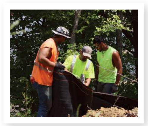
lowa County / WIS 130 Arbor Green, Inc.