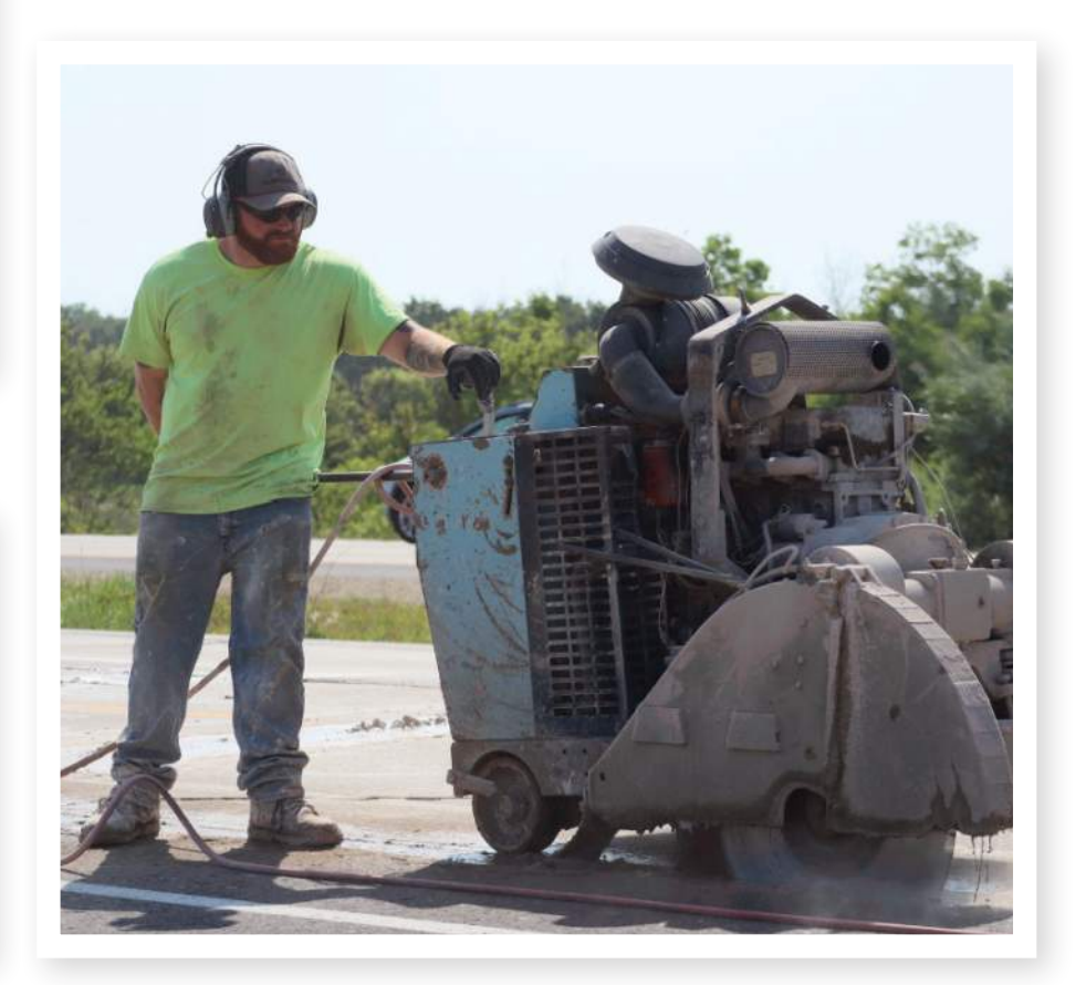
Dane County / US 18-151 Hard Rock Sawing & Drilling Specialist Co.