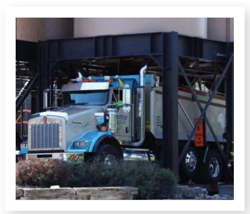
Dane County / US 18-151 Bullet Transit Co., Inc.