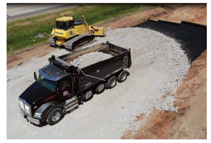
DBE trucking firm CT Enterprises of Sand Creek, LLC and geotextile fabric supplied by DBE Heider & Bott Company.

Heider & Bott and American Construction Supplies were able to provide the increased quantity of geotextile fabrics and steel for concrete pavement, respectively. These two construction supplies were integral to the design of both the subgrade improvements and the high-quality concrete pavement needed for this project. Other DBE subcontractors like CT Enterprises and Arbor Green stepped up to the challenge with the expansion of work with the large change order approved. Hard Rock Sawing & Drilling was able to adjust on the fly to meet the demands of the changing project. Even though the change order was large and demanding, the work is scheduled to get done sooner than everyone thought and all the DBE subcontractors and suppliers were able to manage the load. The STH 29 project turned out to be a winning project for everyone involved.