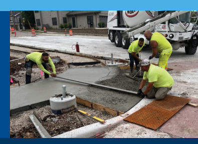
WisDOT offers great opportunities and resources for DBEs!