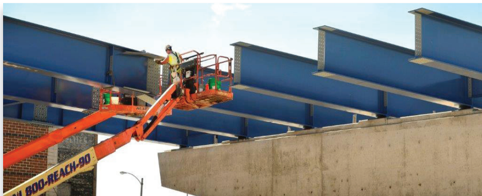
Interstate Highway 794