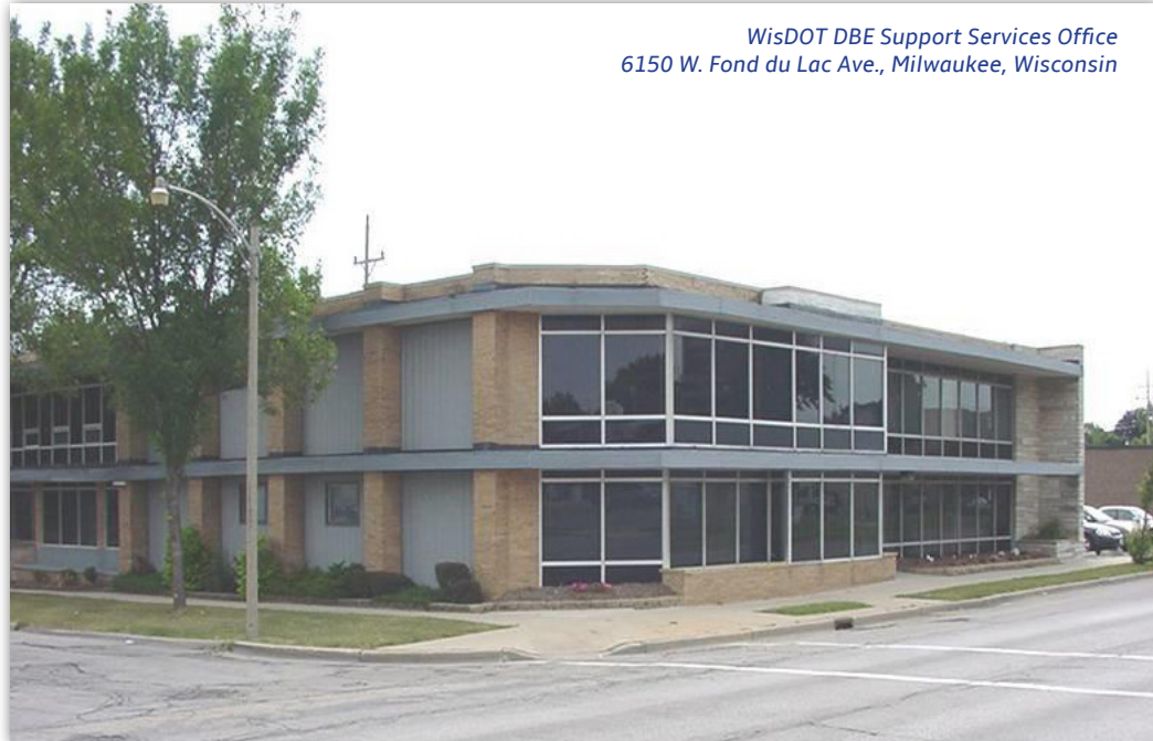
WisDOT DBE Support Services Office 6150 W. Fond du Lac Ave., Milwaukee, Wisconsin