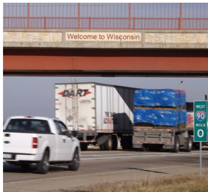
I-39/ 90 Expansion Project.