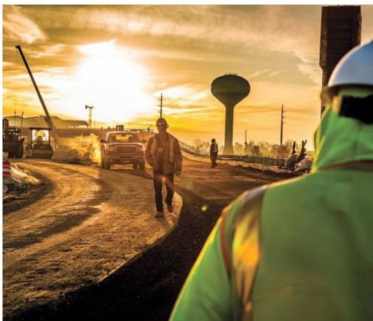
US 45 At Watertown Plank Road.