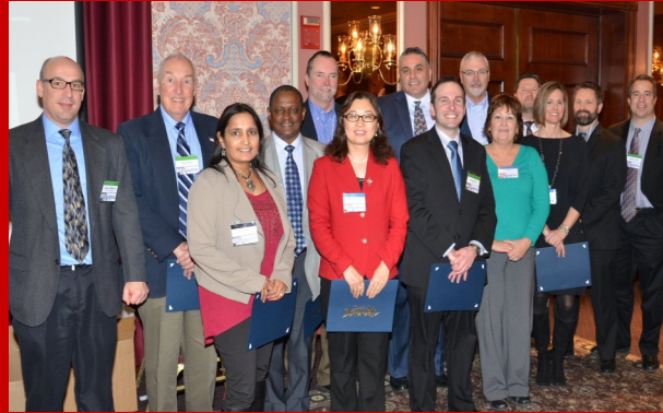
Mentor Protégé Class of 2015

DOT Mentoring is a business-to-business relationship that allows firms to share their expertise and resources to create a stronger economy with a more competitive business environment.