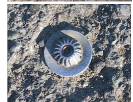
Figure 3. Monuments