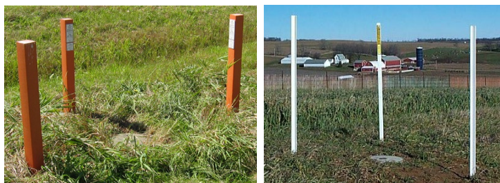
Figure 5. Orange guard or white witness posts surround a typical geodetic survey control station installation. Some of these monuments may have only 1 or 2 posts.