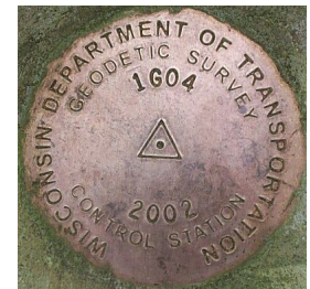
Figure 2. Geodetic survey control station