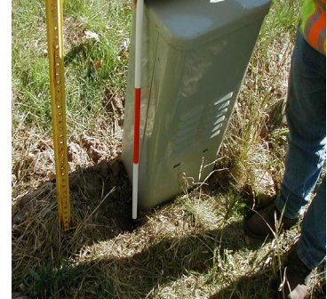
Figure 1. Pedestal too close to ROW pin.

Effective with utility permits issued on or after December 1, 2010, a utility shall relocate any portion of its facility at its own cost when found not to be in compliance with this policy. Failure to do this may cause the utility's permit associated with the facility to be revoked.