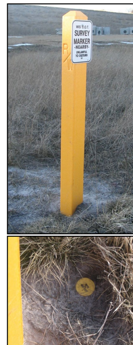
Figure 4. ROW monument with yellow cap and yellow plastic post with sign nearby. Posts may be metal too.