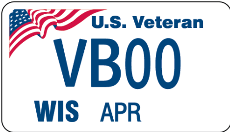
U.S. Veteran Motorcycle plate