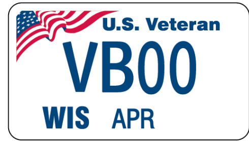
U.S. Veteran Motorcycle plate