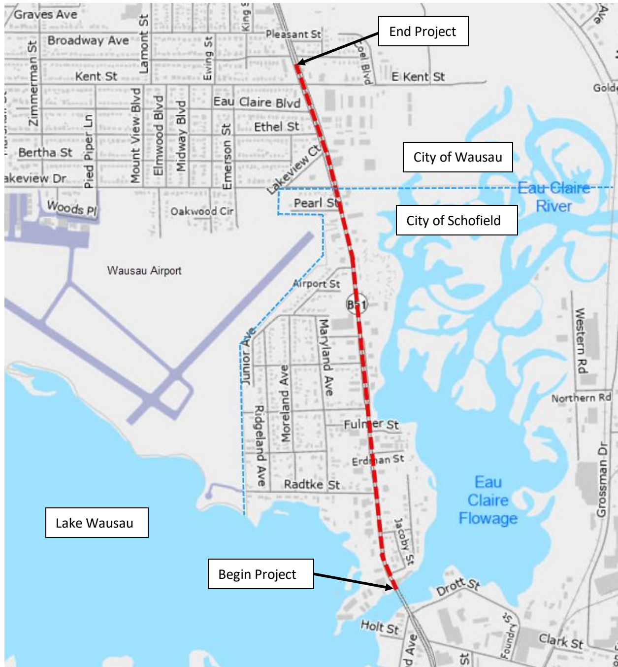
Business 51 Location Map

The project is located on Business 51 from the Eau Claire River Bridge to Kent Street in the cities of Schofield and Wausau, Marathon County.