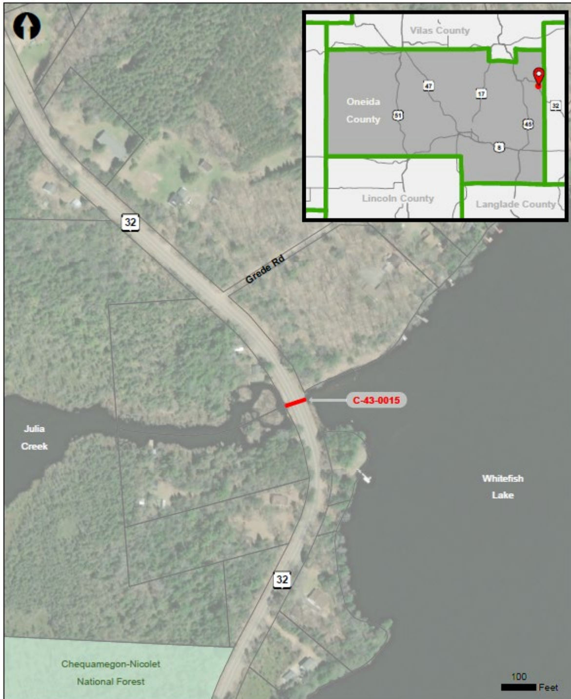
Figure 1: Project Location Map

We are proposing to replace the WIS 32 culvert for the Whitefish Lake Inlet in the town of Three Lakes in Oneida County.