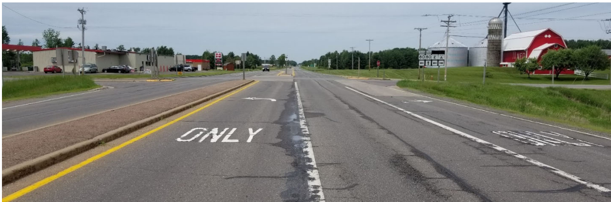
Figure 2: View approaching the WIS 73/WIS 80/Wood County A intersection traveling west on WIS 73