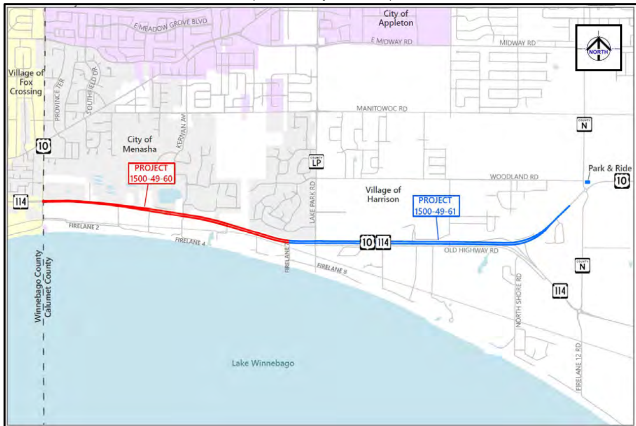
(US 10 Project Limits)

The project is located on US 10 between WIS 114 and County N. The project is located in the city of Menasha and village of Harrison.