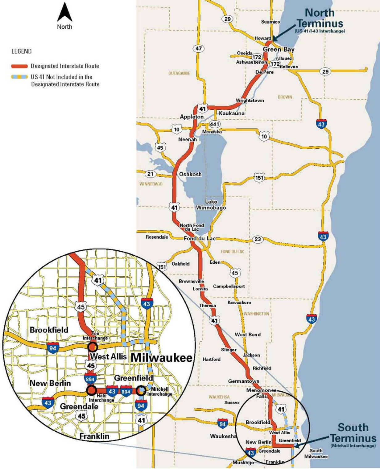
EXHIBIT 1 Project Location Map US 41 Interstate Conversion Plan ID 1113-00-00