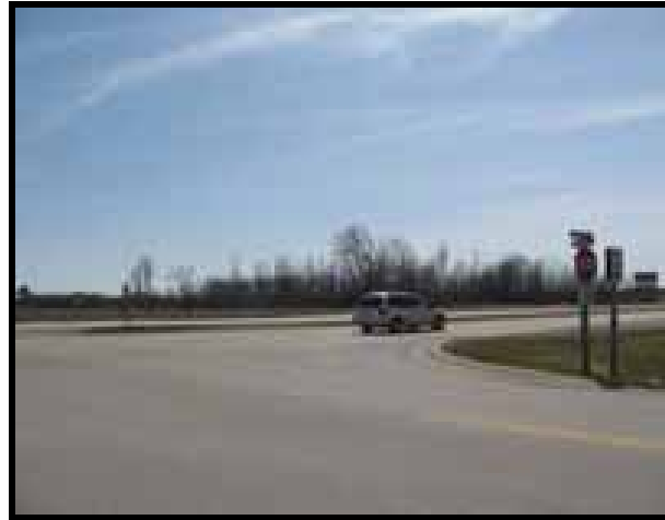
WisDOT is dedicated to keeping the public involved throughout each step of the study process.

As part of the freeway designation and right of way preservation efforts in Sheboygan County, the project team will identify future needs along the WIS 23 corridor. WisDOT will work with communities to identify the locations of future interchanges, local road modifications and any changes needed to existing multi-modal facilities.