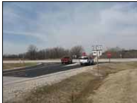
During the next two years, WisDOT will develop a plan to preserve the right of way along WIS 23 in Sheboygan County.

Public input and involvement will be vital to the success of this right of way preservation effort ( Page 3 ).