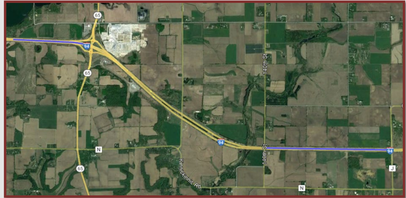
— Project Locations