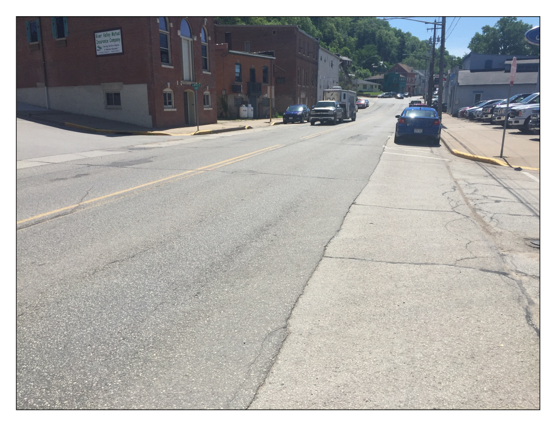
Deteriotating pavement in Fountain City along WIS 35

The WIS 54 segment serves as a vital connector between Minnesota and Wisconsin. The pavement has previously had a problem with rutting, and the existing asphalt surface was placed by the county in 2018. However, the pavement has continued to deteriorate.