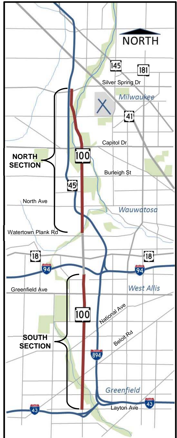
WIS 100 Study Corridor Map