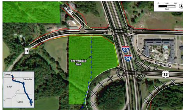
Split Diamond Interchange Alternative