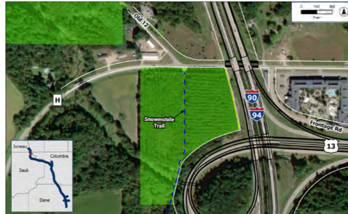
Trumpet Interchange Alternative (Preferred Alternative)