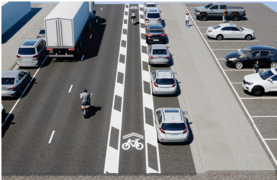
Buffered Bike Lane