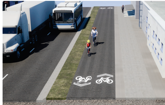
Sidewalk-Level Cycle Track