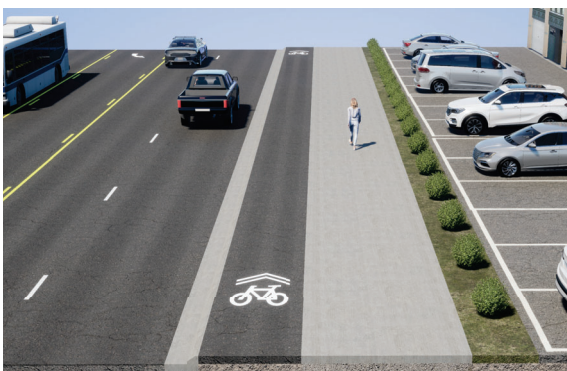
Sidewalk-Level Bike Lane