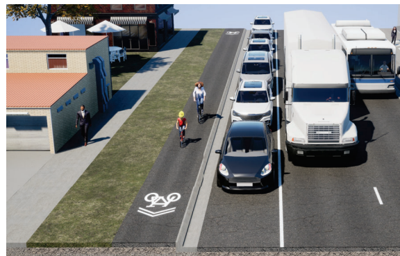
Parking-Protected Bike Lane