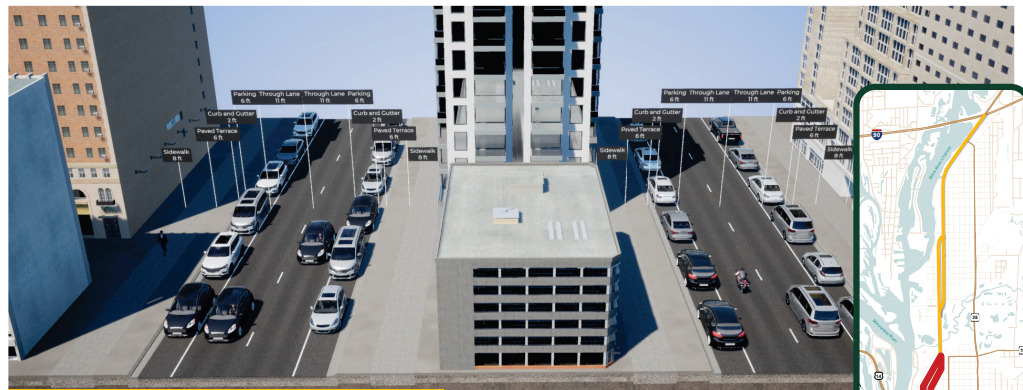
Narrow Parking, Widen Sidewalks Total Width (Curb to Curb): 38 ft (SB US 53), 38 ft (NB US 53)