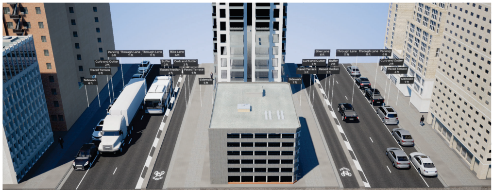
Remove Parking (Separated Bike Lane – Left Side) Total Width (Curb to Curb): 42 ft (SB US 53), 42 ft (NB US 53)

Remove Parking (Separated Bike Lane – Left Side)