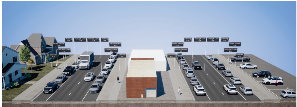
Existing Typical Section Total Width (Curb to Curb): 48 ft (SB US 53), 48 ft (NB US 53)