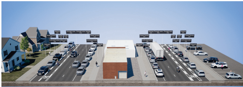
Add Buffered Bike Lanes Total Width (Curb to Curb): 48 ft (SB US 53), 48 ft (NB US 53)