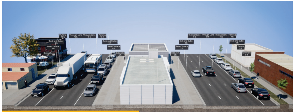
Existing Typical Section Total Width (Curb to Curb): 46 ft (SB US 14/61), 44 ft (NB US 14/61)