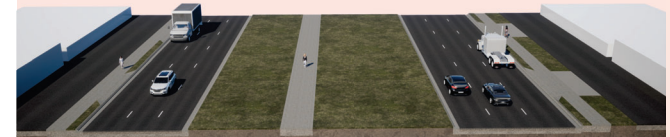
Cross section from Pflaum Road to Buckeye Road

Moves US 51 to replace the existing frontage road system and connects business driveways directly onto US 51.