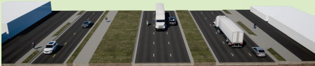
Cross section from Pflaum Road to Buckeye Road

Hybrid intersections minimize the impact of keeping frontage roads.