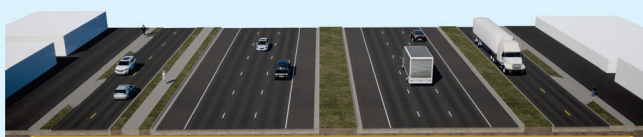
Cross section from Pflaum Road to Buckeye Road

Maintains 45 mph speeds compatible with hybrid intersections that improve east/west crossing.