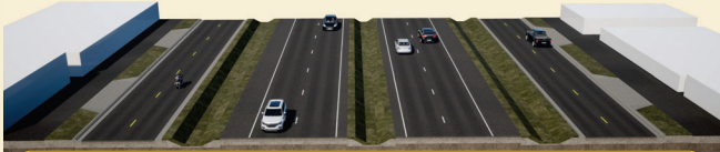
Cross section from Pflaum Road to Buckeye Road

No improvements beyond routine maintenance.