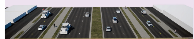
Cross section from Pflaum Road to Buckeye Road

Intersection delay is reduced by adding turn lanes and spacing to frontage road improved, but the footprint is large.