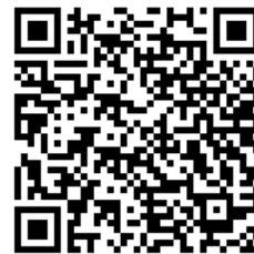
WIS 11 and E JCT WIS 81