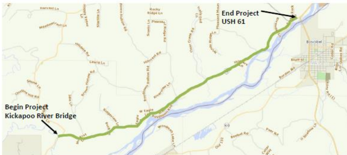
WisDOT ID: 5180-00-03 Project Location Map