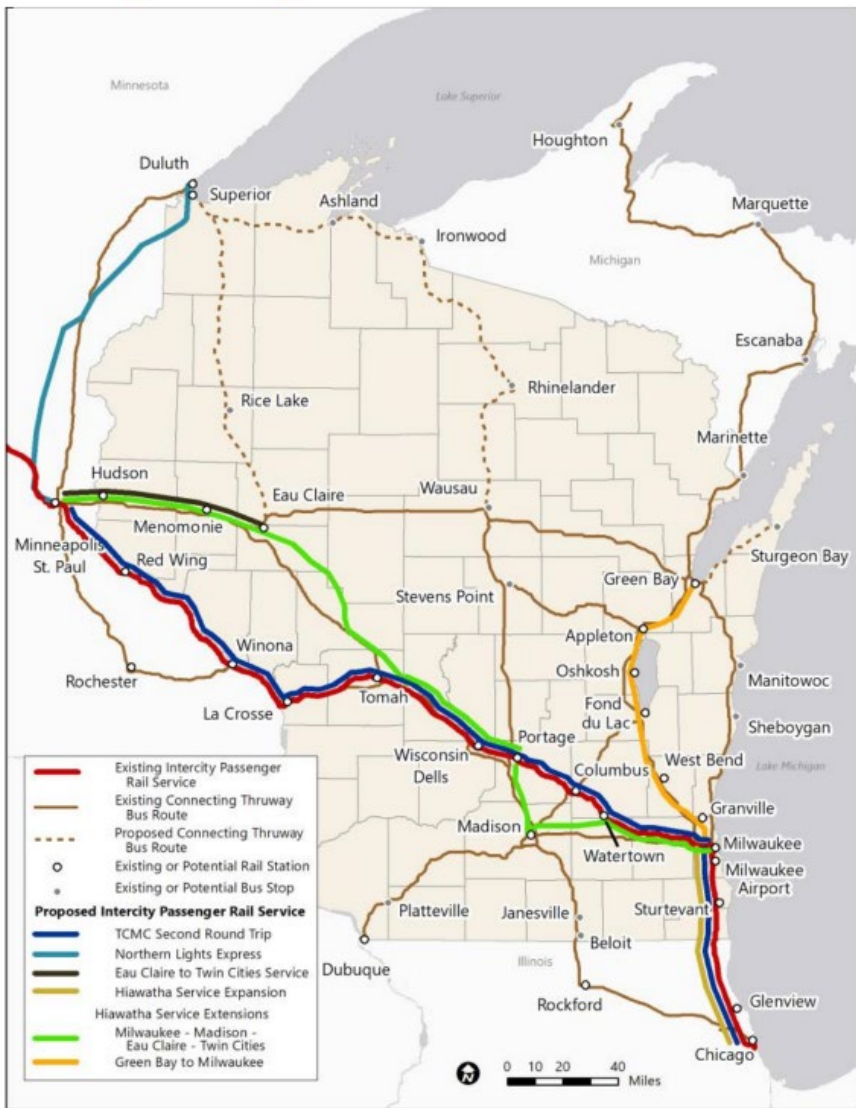
Figure 3-1: Wisconsin 2050 Potential Intercity Passenger Rail System