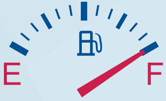
full tank of gas