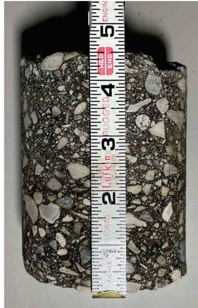
C-1 4.5" ASPHALT STA: 10+28 RAB RT