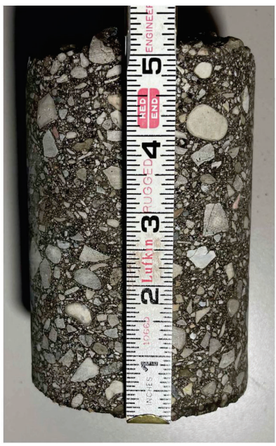
C-2 5.2" ASPHALT 12+11 RAB RT