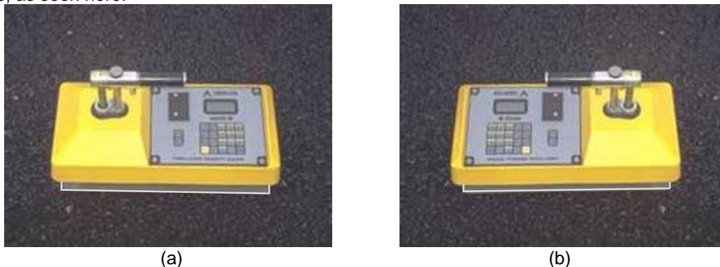
Figure 2: Nuclear Gauge Orientation for (a) 1 st One-Minute Reading and (b) 2 nd One-Minute Reading

The nuclear site is the same for QC and QV readings for the test strip, i.e., the QC and QV teams are to take nuclear density gauge readings in the same footprint. Each of the QC and QV teams are to take a minimum of two one-minute readings per nuclear site, with the gauge rotated 180 degrees between readings, as seen here: