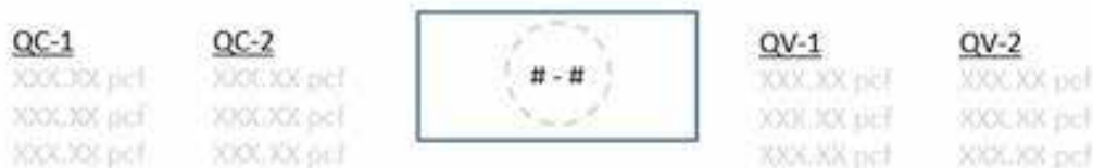
Figure 3: Layout of Raw Gauge Readings as Recorded on the Pavement

Take photos of each of the 10 core/gauge locations of the test strip. Include gauge readings (pcf) and a labelled core within the gauge footprint. If a third reading is needed, record and document all three readings. Only raw readings in pcf shall be written on the pavement during the test strip, with a corresponding gauge ID/SN (generalized as QC-1 through QV-2 in the following Figure) in the following format: