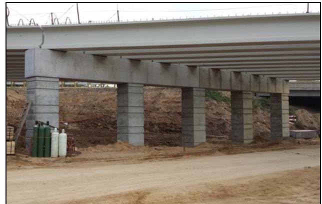
Siggelkow Road (2014)