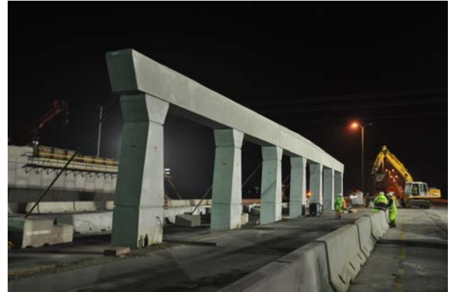
Rawson Avenue Bridge (2013)