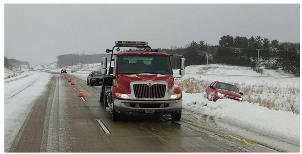
Portage Co Sheriff's Department working a slide off with AJ's Towing from Amherst Junction