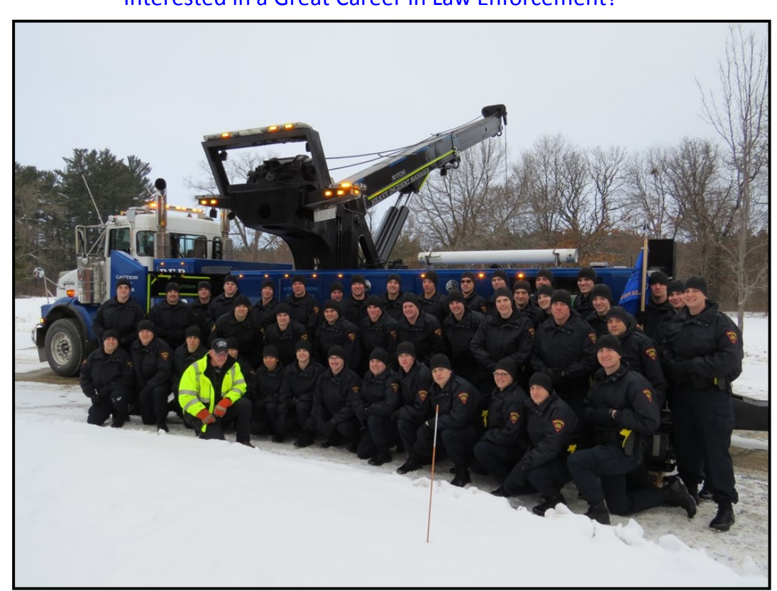
Interested in a Great Career in Law Enforcement?

"Just wanted to let you know that the training and demonstration conducted by PER last week for the 62<sup>nd</sup> Recruit Class was very well received. PER did an excellent job! Thanks again for making this possible, it was a great way to end the traffic incident management training and bring everything together".