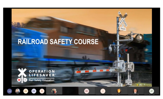
10 virtual regional TIME meetings with 554 attendees