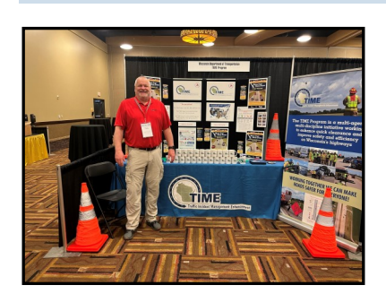
12 conferences attended reaching approximately2,000 first responders