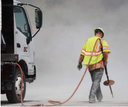
Ozaukee County / I-43 North South Interstate Sealant & Concrete, Inc.

DBE partnership on WisDOT projects makes Wisconsin stronger