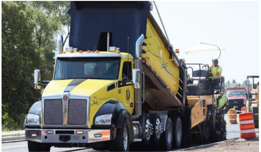
Milwaukee County / I-43 & County Line Road DMS Transportation, LLC

DBE partnership on WisDOT projects makes Wisconsin stronger