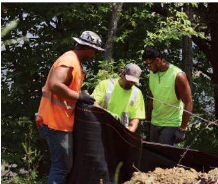
Iowa County / WIS 130 Arbor Green, Inc.