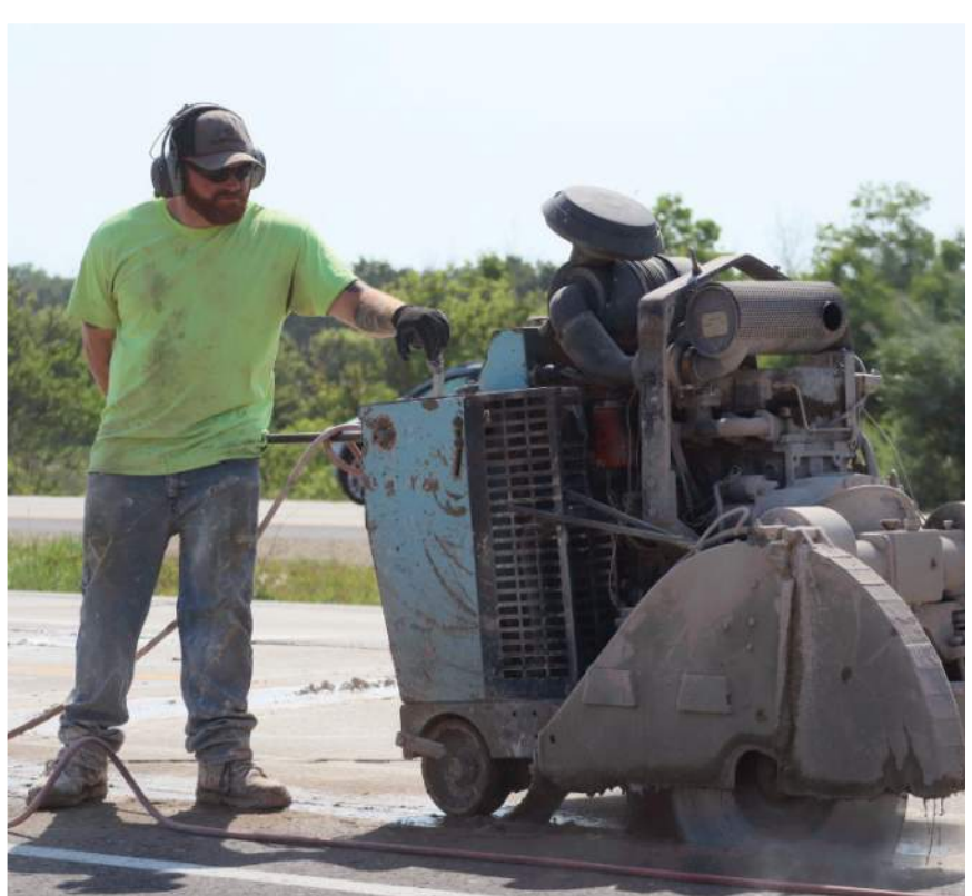
Dane County / US 18-151 Hard Rock Sawing & Drilling Specialist Co.