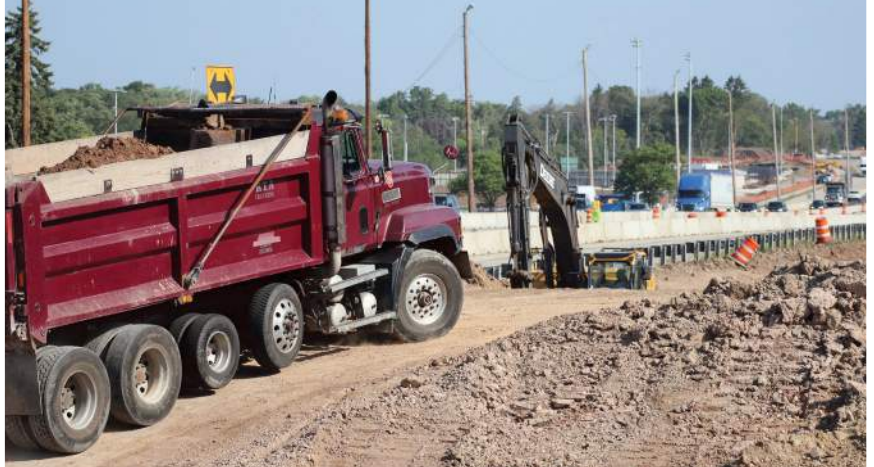
Milwaukee County / 1-43 North South RTA Trucking, LLC