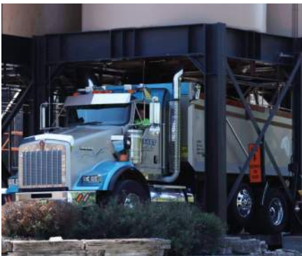
Dane County / US 18-151 Bullet Transit Co., Inc.