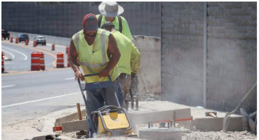
Milwaukee County / I-43 & County Line Road Arrow-Crete Construction, LLC