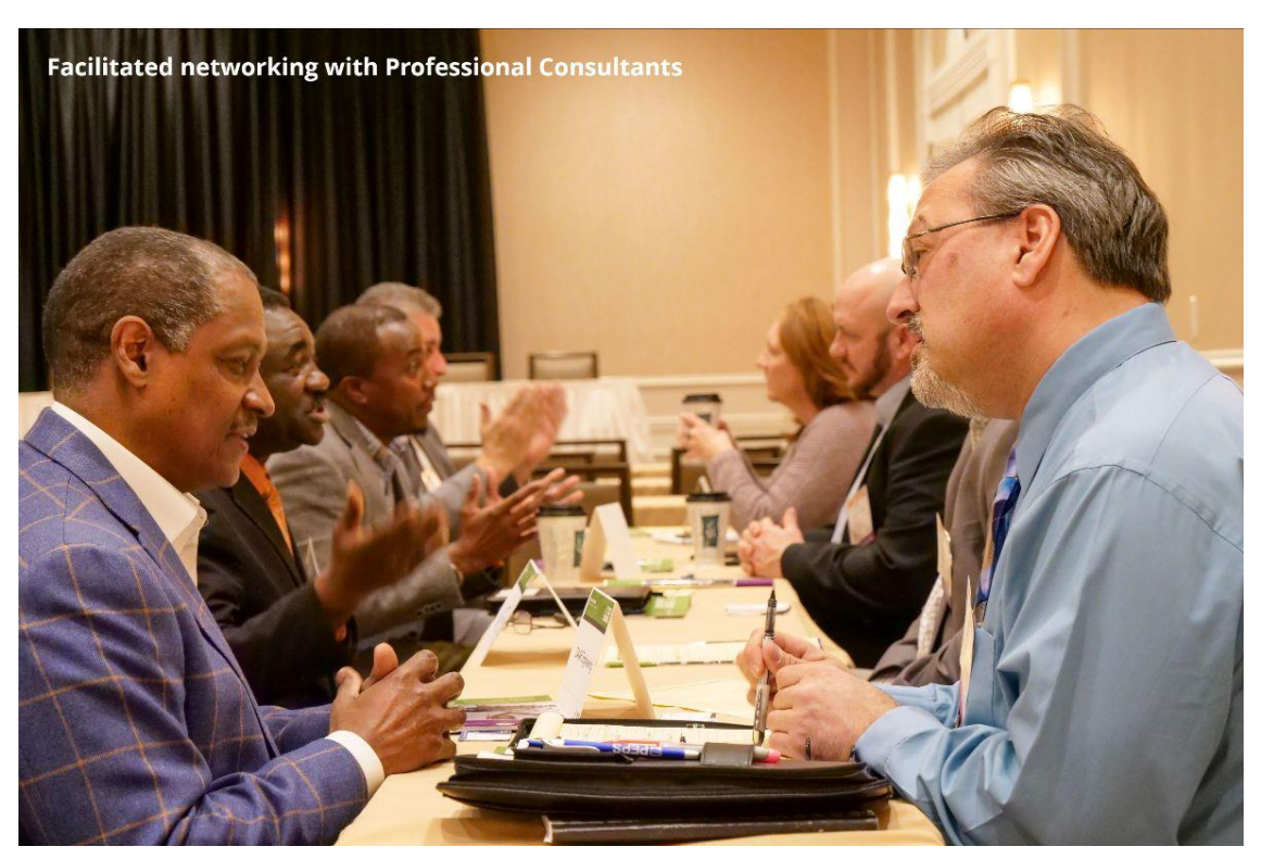
WisDOT's 34<sup>1H</sup> Annual DBE Workshop and Secretary's Golden Shovel Awards conference in partnership with the National Association of Minority Contractors Wisconsin Chapter was held February 19 – 20, 2020 at The Ingleside Hotel in Pewaukee, Wisconsin.