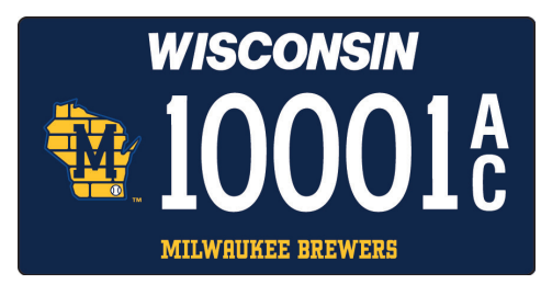
Brewers "M" logo plate

When you purchase Milwaukee Brewers license plates, your fee includes an annual $25 tax-deductible donation. This donation, less a 2% licensing fee to Major League Baseball, is used by the Southeast Wisconsin Professional Baseball Park District, which oversees Milwaukee Brewer's Ballpark on behalf of the taxpayers of the five counties comprising the district. All proceeds received by the District will be fully and solely dedicated to Ballpark maintenance.