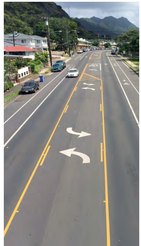
Road Diet project in Honolulu, Hawaii.

A Road Diet can be a low-cost safety solution when planned in conjunction with a simple pavement overlay, and the reconfiguration can be accomplished at no additional cost. Typically, a Road Diet is implemented on a roadway with a current and future average daily traffic of 25,000 or less.