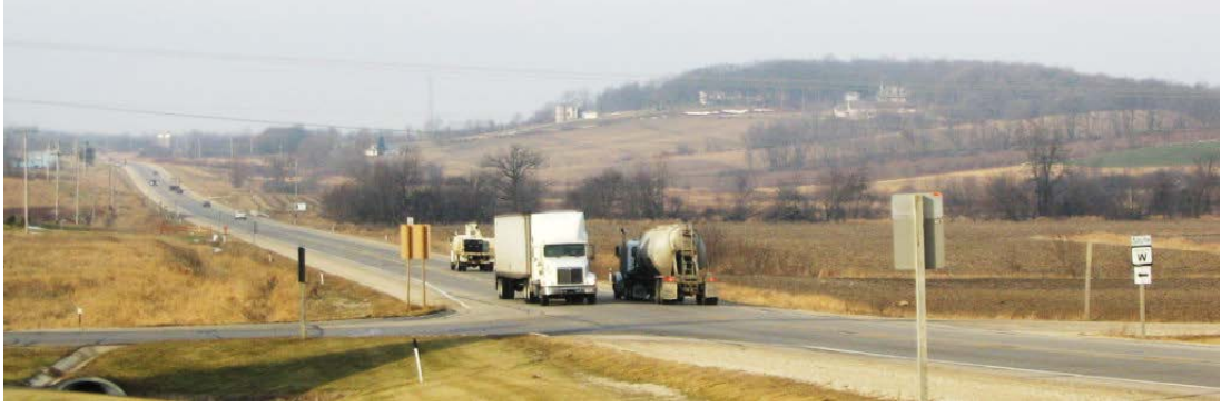
View of the WIS 23 corridor.